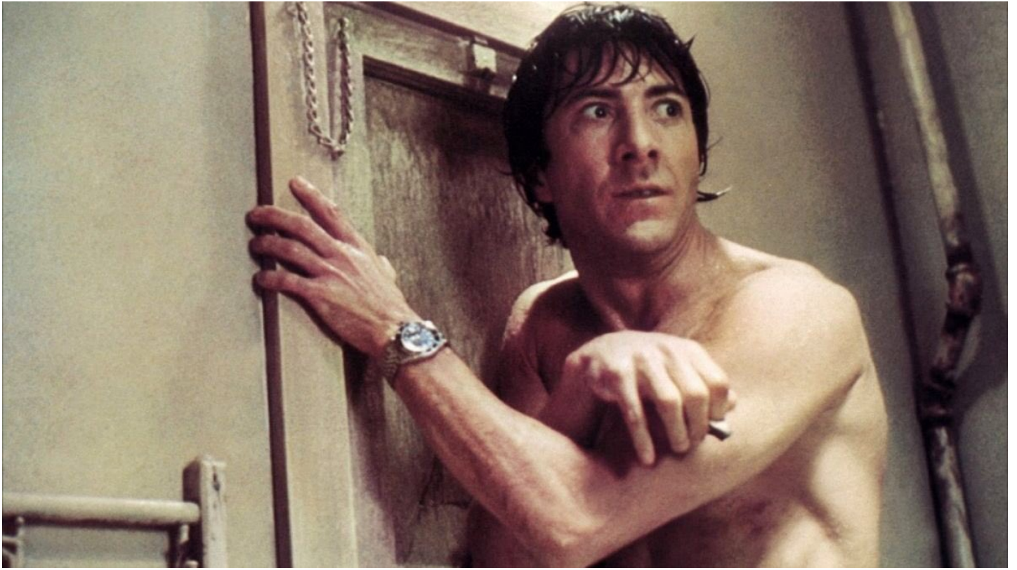
All the President's Men