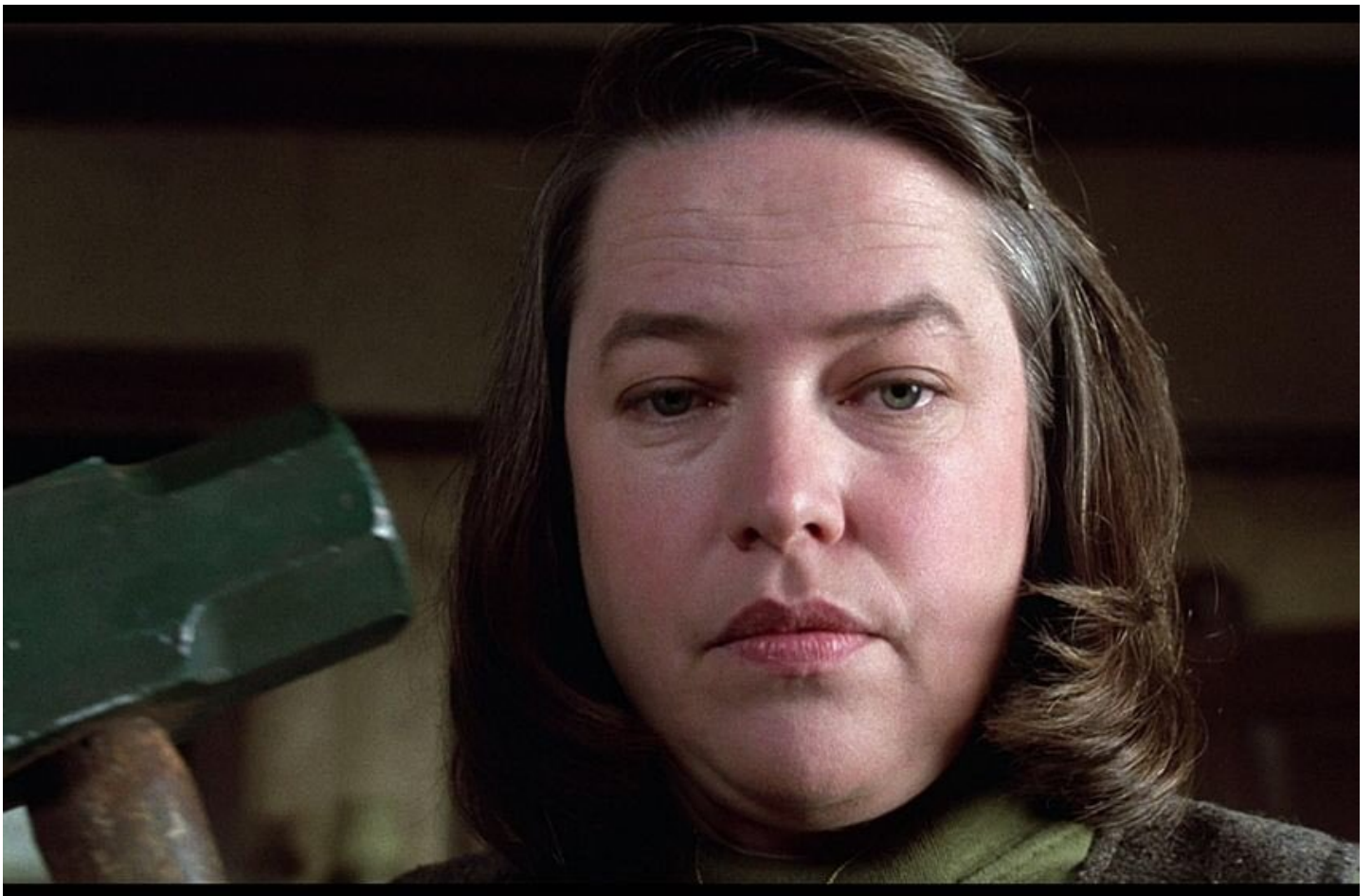
The Princess Bride