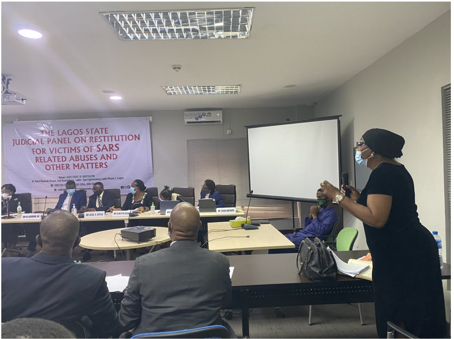
His case is adjourned to Jan 26, 2021 where the final address would be given. #ENDSARS