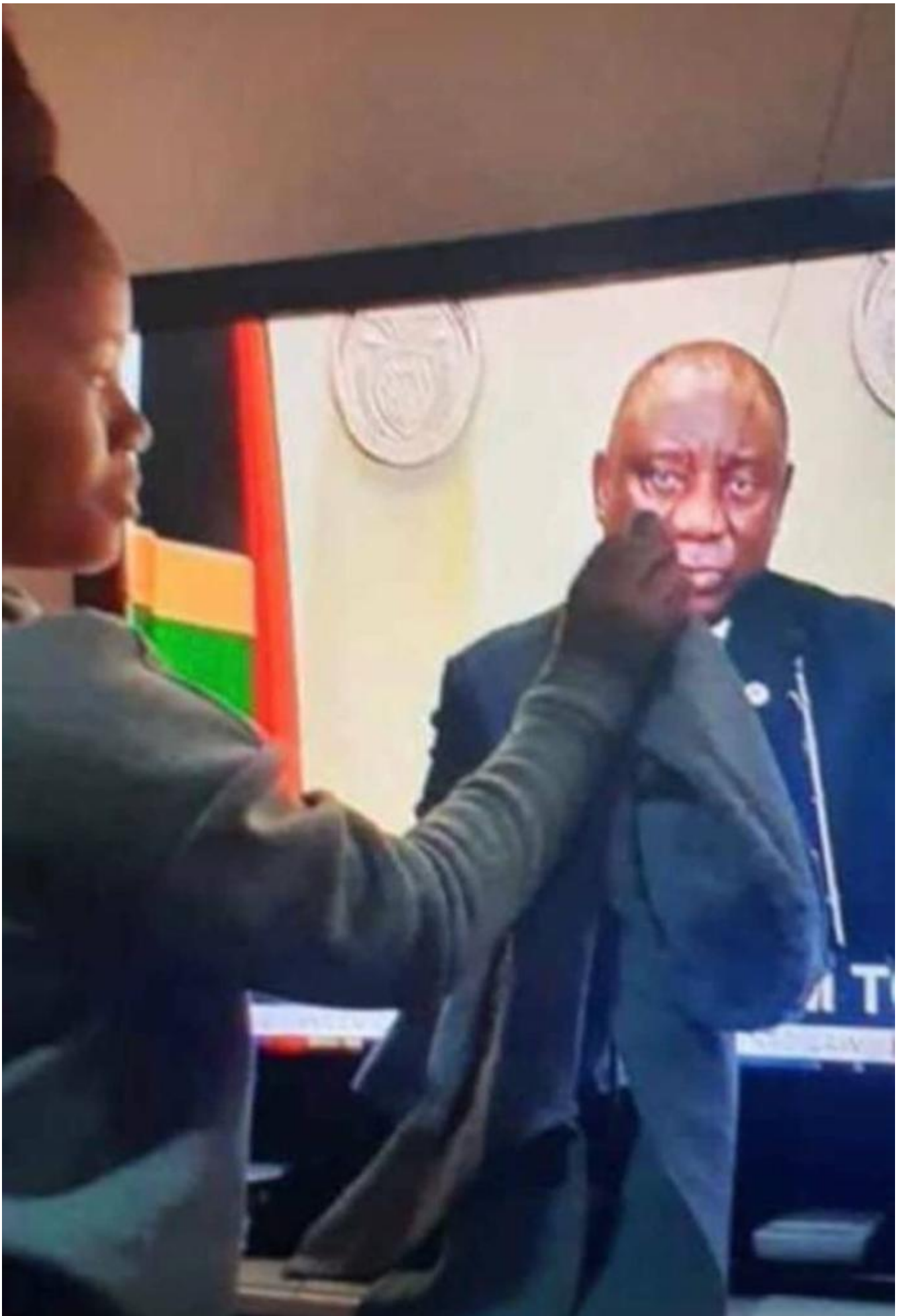
The President of South Africa appeared on national TV to tell some lies in support of perpetuating destructive Covid malarkey. Out came the old chestnut that data support the effectiveness of past measures. Where is this magic data? 2/12