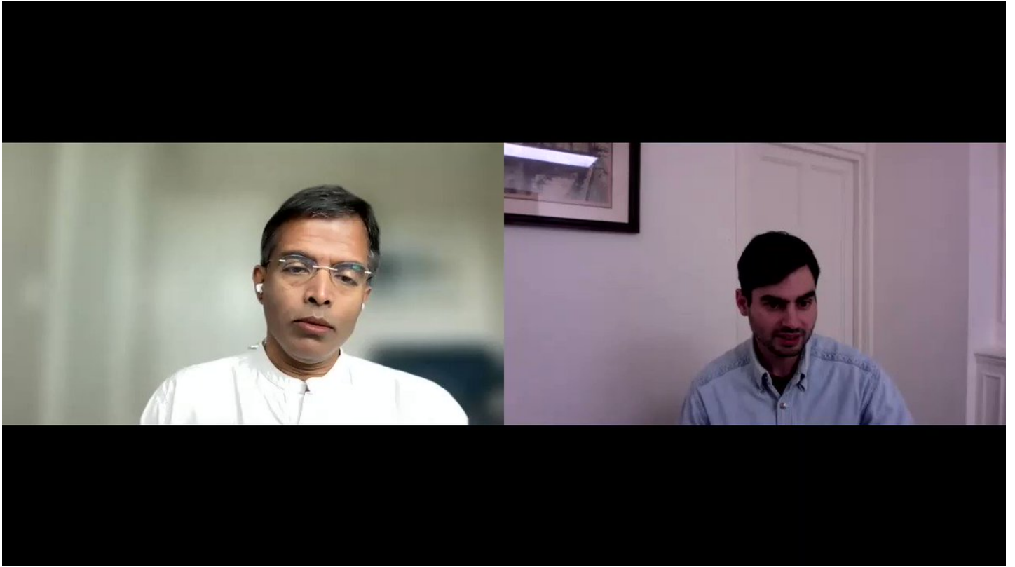
On "circle of competence":