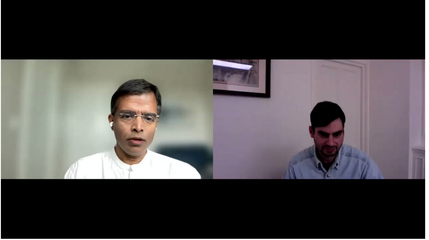
On copying Warren Buffett: