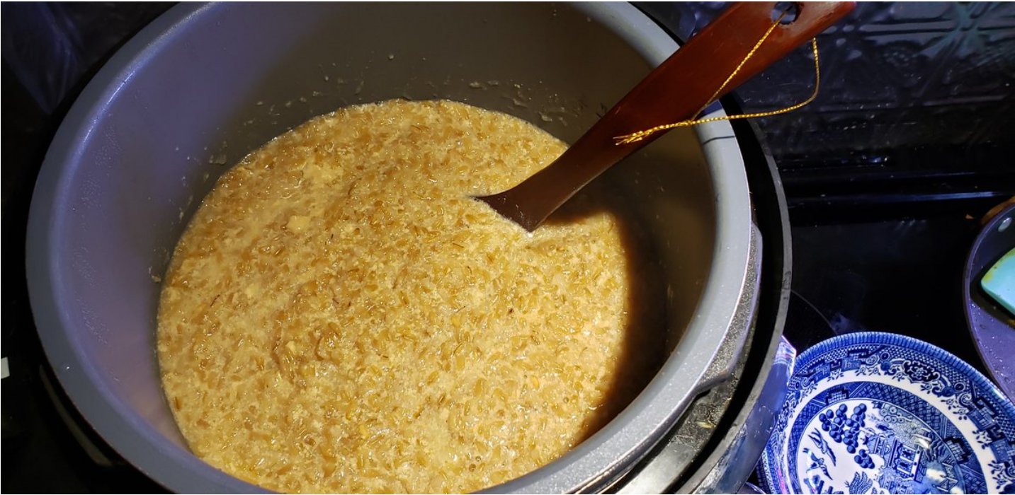
Groats for a week