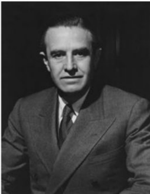
W. Averell Harriman

As a member of "The Wise Men," he helped create bi-partisan foreign policy based on the resistance to Soviet Expansion. The Wise Men were the "hidden architects" behind The Truman Doctrine, The Marshall Plan and Cold War containment.