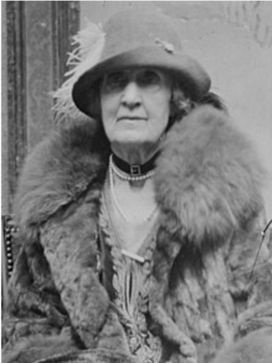
Harriman c. 1927

One of her sons is Averell Harriman. Served as Secretary of Commerce under Harry S. Truman. Potus and Flotus are standing under Harry S. Truman. He was also JFK's Asst. Secretary of State for East Asian and Pacific Affairs and also Under Secretary of State for Political Affairs.