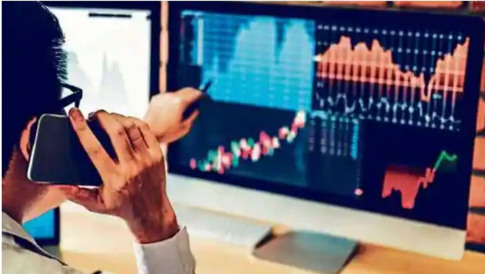
Top stock picks.

2 min read . Updated: 10 Jan 2022, 11:07 AM IST