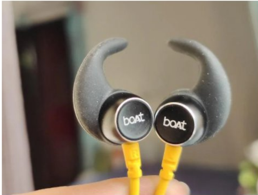
BoAt audio device | representative image

Electronics manufacturing firm Dixon Technologies and Imagine Marketing -- the parent company of earwear brand boAt -- have formed a 50:50 joint venture to manufacture Bluetooth enabled audio devices.