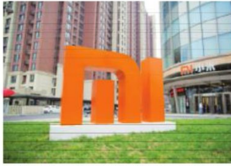
The Chinese companies are eyeing Indian government's cash incentives linked to production capacity.

Representatives for Lava, Dixon, Xiaomi and Oppo did not respond to requests for comment. A spokesman for