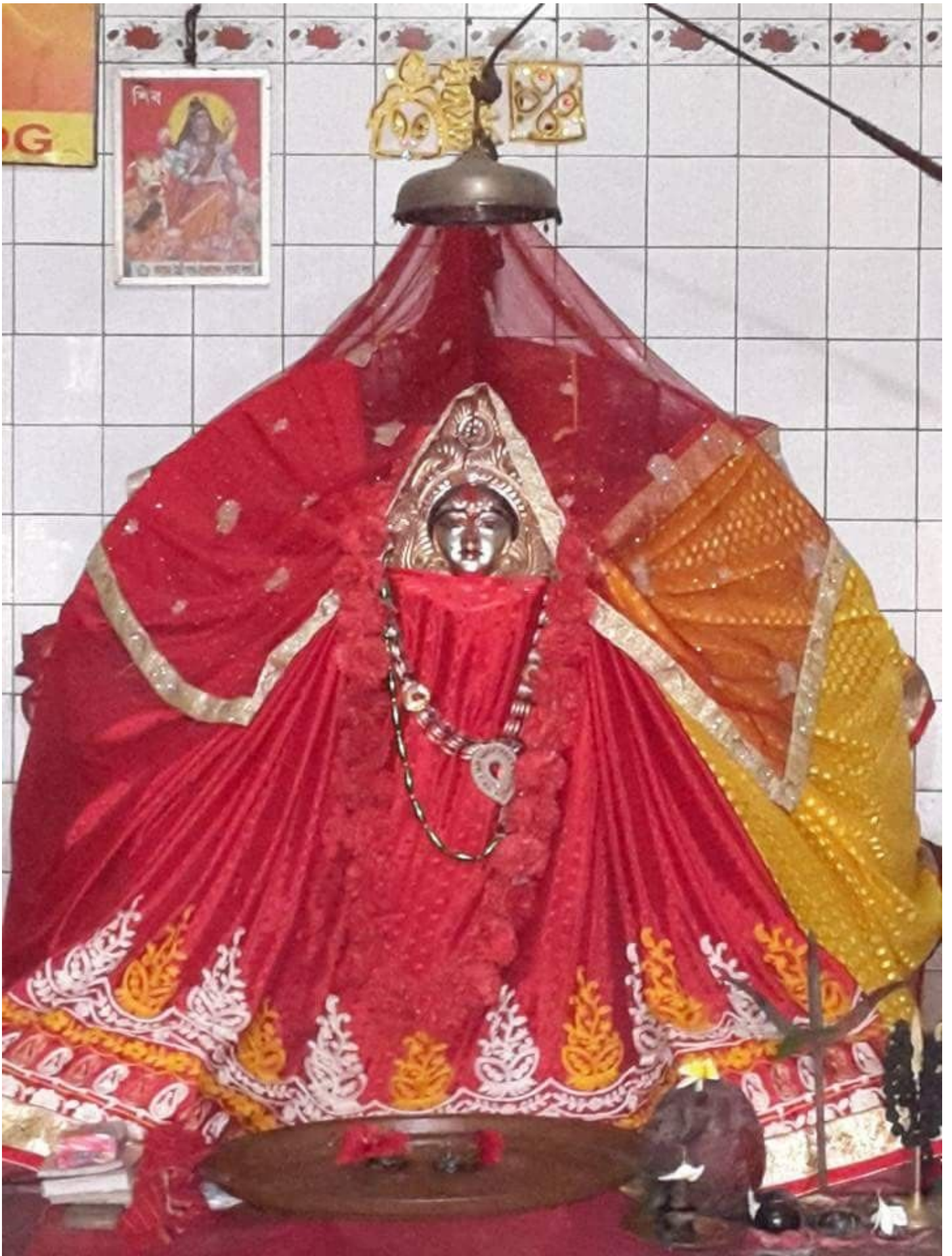
■12. Yogeshwari Shakti-Peeth, Bangladesh