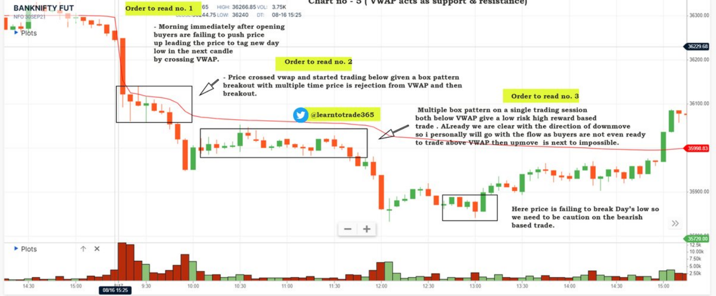
Chart no - 5 ( VWAP acts as support & resistance)