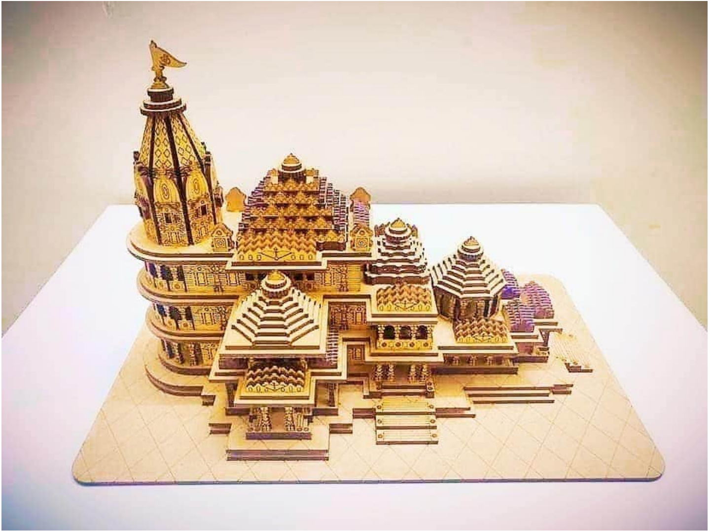
The root of the word Ram is ram- which means "stop, stand still, rest, rejoice, be pleased". #RamMandirNidhiSamarpan Donate 4 Ram