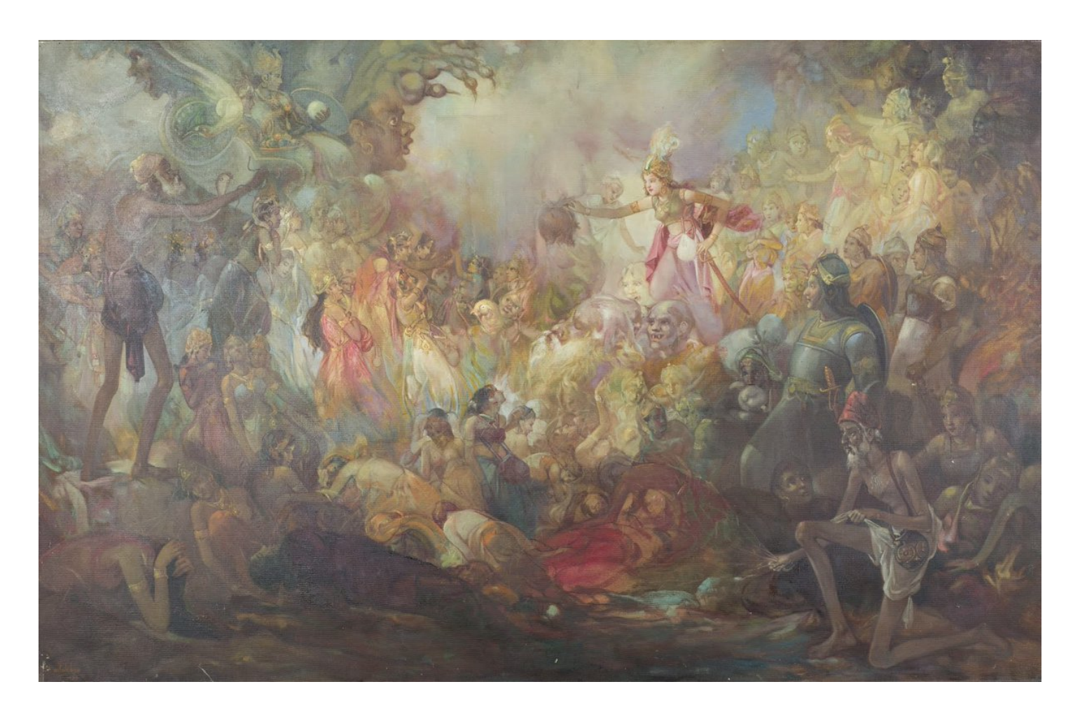
Going forward we're amenable to & appreciative of additional people who would be interested in becoming Friends of Hoshruba. We will also be very appreciative of smaller contributions & shall also seek some institutional contributions. 1/2 the sale proceeds of Hoshruba volumes 9/