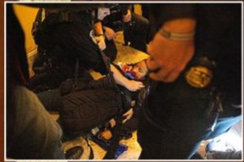
Smash and grab: Armed cops stop mob at chamber doors while a woman is treated after being shot (above)