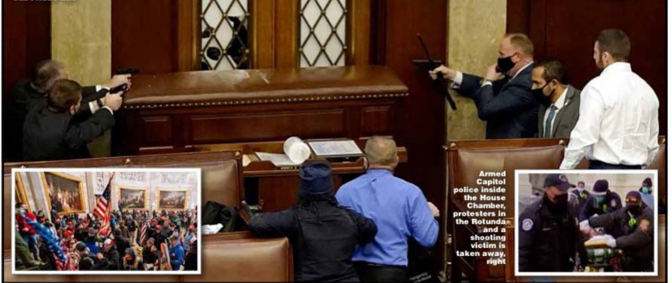
Armed Capitol police inside the House Chamber, protesters in the Rotunda, and a shooting victim is taken away, right