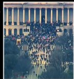
Surge: Trump followers swarm Capitol

It came only hours after Mr Trump told a rally of supporters outside the