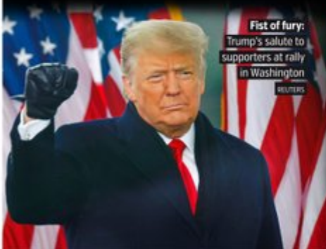
Fist of fury: Trump's salute to supporters at rally in Washington

■ TRUMP SUPPORTERS STORM CONGRESS AS LAST BID TO OVERTURN ELECTION FAILS