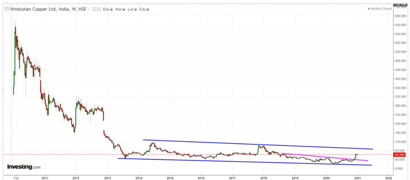
Hind copper - Update

Hind Copper - Next multibagger in the making. it can take some more time before that. Keep an eye