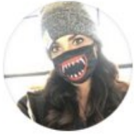
Soledad O'Brien ✓ @soledadobrien