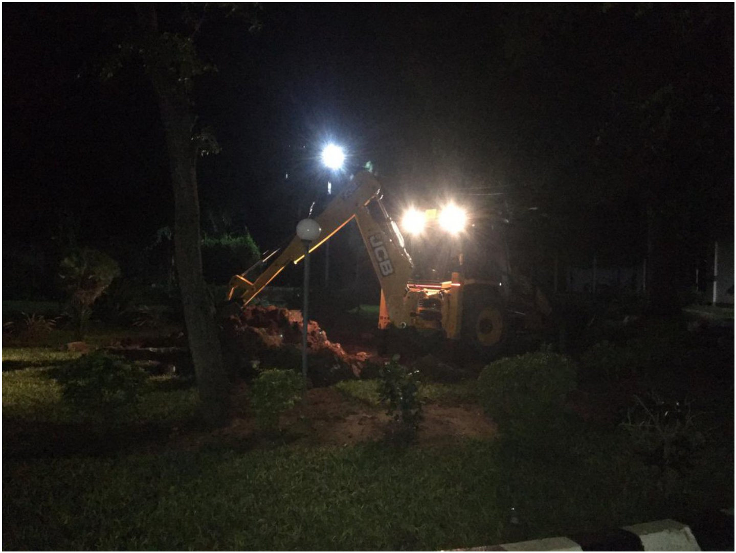
Heavy machinery has been pictured inside the campus toppling the monument.

A monument paying tribute to the tens of thousands of Tamils massacred by the Sri Lankan state at the University of Jaffna is currently being bulldozed by authorities.