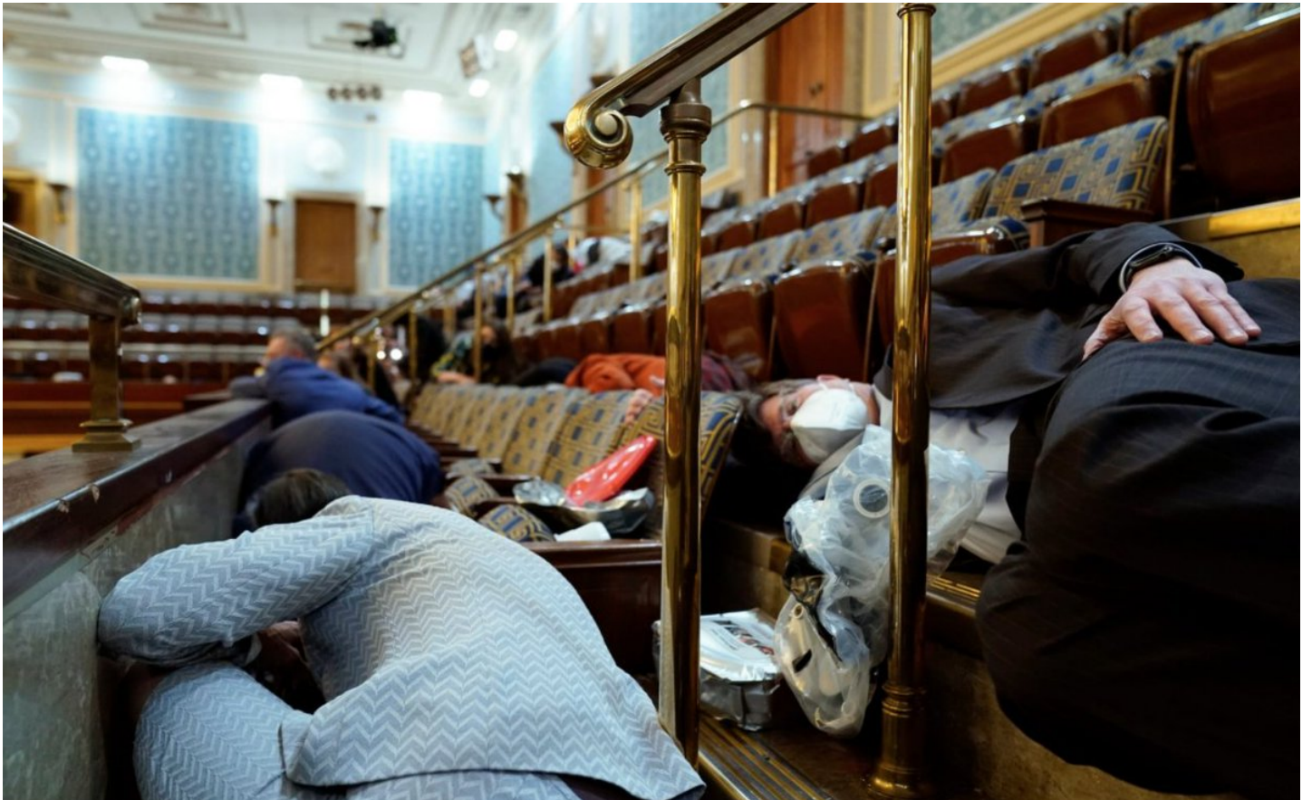
People take shelter in the House Chamber and protestors are detained