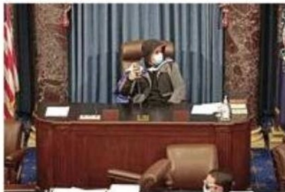
Clockwise from top, rioters climb a wall of the Capitol on Wednesday; a man occupies a seat in the Senate chamber after intruders stormed the room, interrupting a joint session of Congress to ratify President-elect Joe Biden's win; and police officers pull their guns as intruders break into the House chamber.