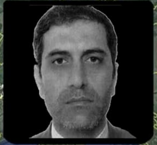
Iranian Diplomat Assadollah Assadi

Among other documents uncovered in Asadi's cases is a 200-page, green-checked ledger with receipts showing that the diplomat distributed money to certain people in different European countries.