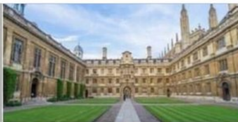
University of Cambridge (1209)