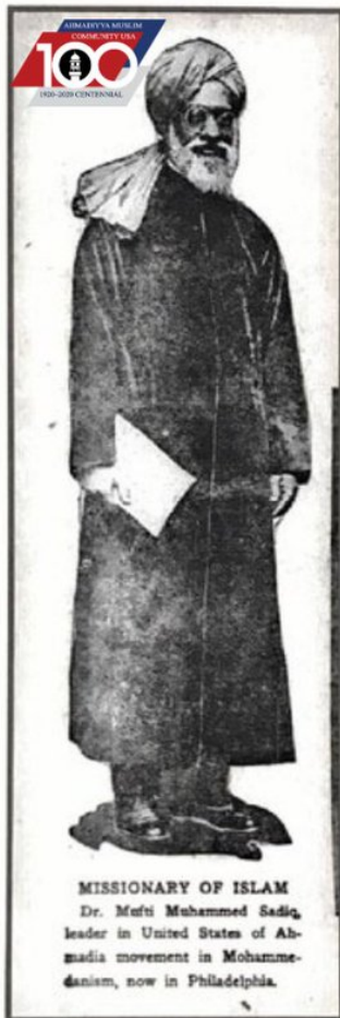
Cutting from The Philadelphia Inquirer (14 March 1920) in which news was given on Hazrat Mufti Sahib's detention upon arrival in the USA