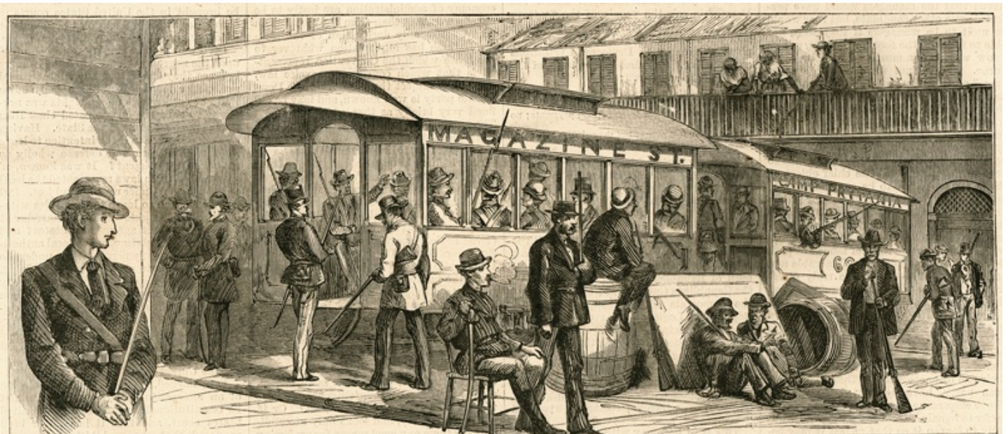
A STREET BARRICADE, GUARDED BY WHITE LEAGUERS. THE LOUISIANA OUTRAGES.—[SEE PAGE 842.]

What followed was a massive street battle between the integrated police forces and the White League. The white supremacists overpowered the police and occupied City Hall and other official buildings.