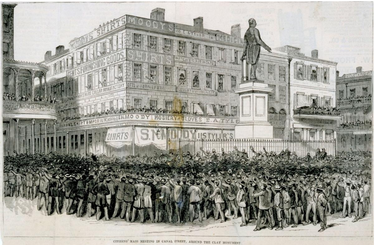
CITIZENS' MASS MEETING IN CANAL STREET, AROUND THE CLAY MONUMENT

What followed was a massive street battle between the integrated police forces and the White League. The white supremacists overpowered the police and occupied City Hall and other official buildings.