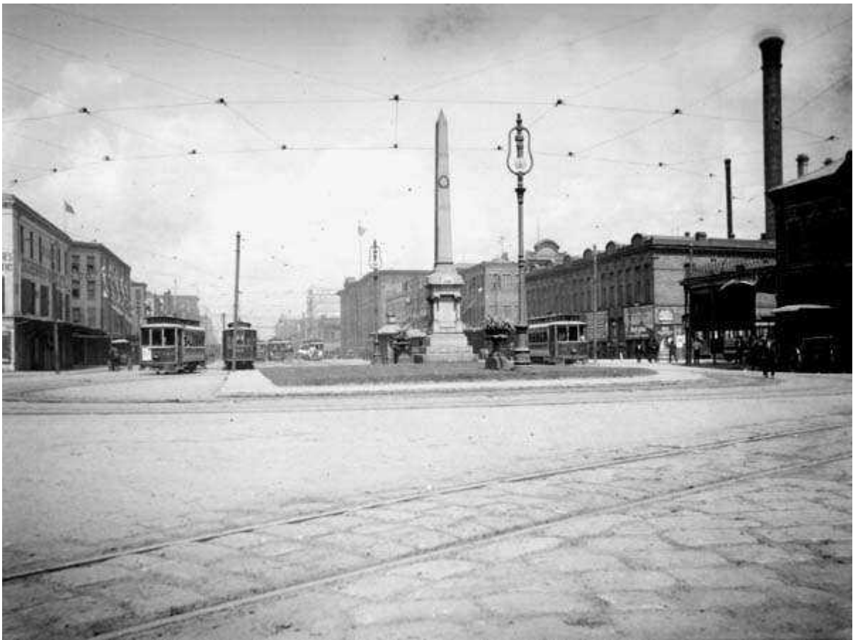
In 1989 when the monument was moved off the main road but still near the Vieux Carre (French Quarter), the city changed the inscription and used the familiar “both sides” phrase while also instructing readers to learn from the past.