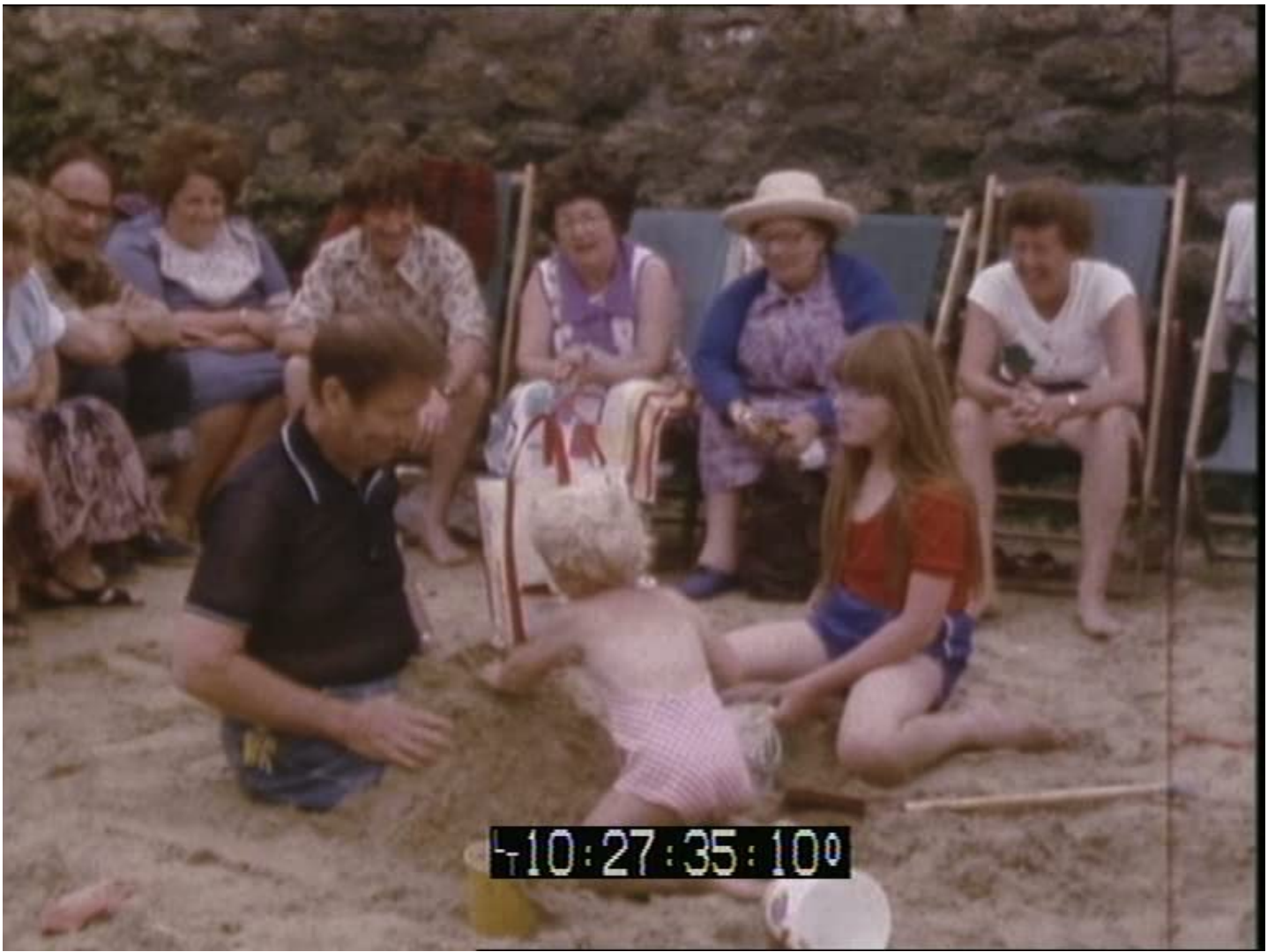
But then, another strange thing happened.