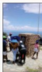
Local and international tourists are flooding resort areas such as Enlha, which has resulted in some struggling for accommodation during the festive season. The above picture collage shows some of the activities currently taking place in the resort areas.

MDC Alliance, Biti slapped with US$1m defamation suit