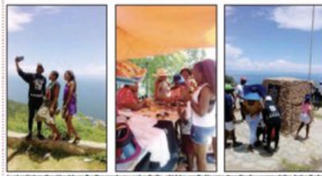
Local and international tourists are breathing new life into the tourism sector in Karika, which has resulted in some struggling for accommodation during the festive season. The above pictures collage shows some of the activities currently taking place in the resort area.

THIS fight over the MDC-T party's voters roll to be used this Sunday at their extraordinary congress mediated yesterday after supporters of secretary general Douglas Mawonzora staged a demonstration at the party headquarters in an attempt to discredit the one favoured by the party interim leader Theobald Khepo. Mwonzora's supporters claimed that Khepo's preferred voters roll, which is based on the 2014 MDC-T structures, which was adopted by the party, was not bona fide and was used by the MDC Alliance at their elective