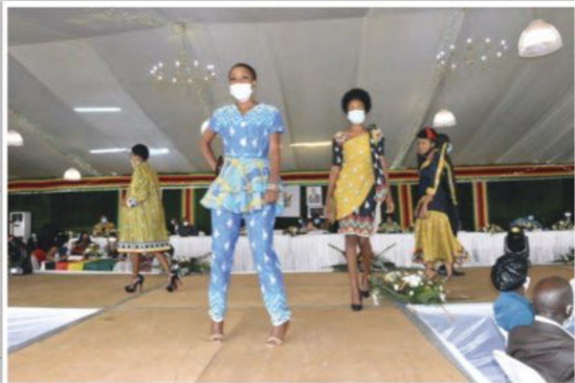
Models showcasing some of the designs at the launch of the Zimbabwe National Dress in Harare yesterday. The designs were ridiculed on social media platforms as lacklustre.

The editor of The Standard and the entire AMH family would like to wish our readers, advertisers and contributors a Merry Christmas and a Prosperous 2021.