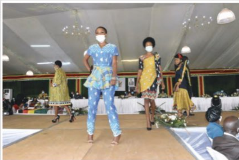
Models showcasing some of the designs at the launch of the Zimbabwe National Dress in Harare yesterday. The designs were ridiculed on social media platforms as lacklustre.

The editor of The Standard and the entire AMH family would like to wish our readers, advertisers and contributors a Merry Christmas and a Prosperous 2021.