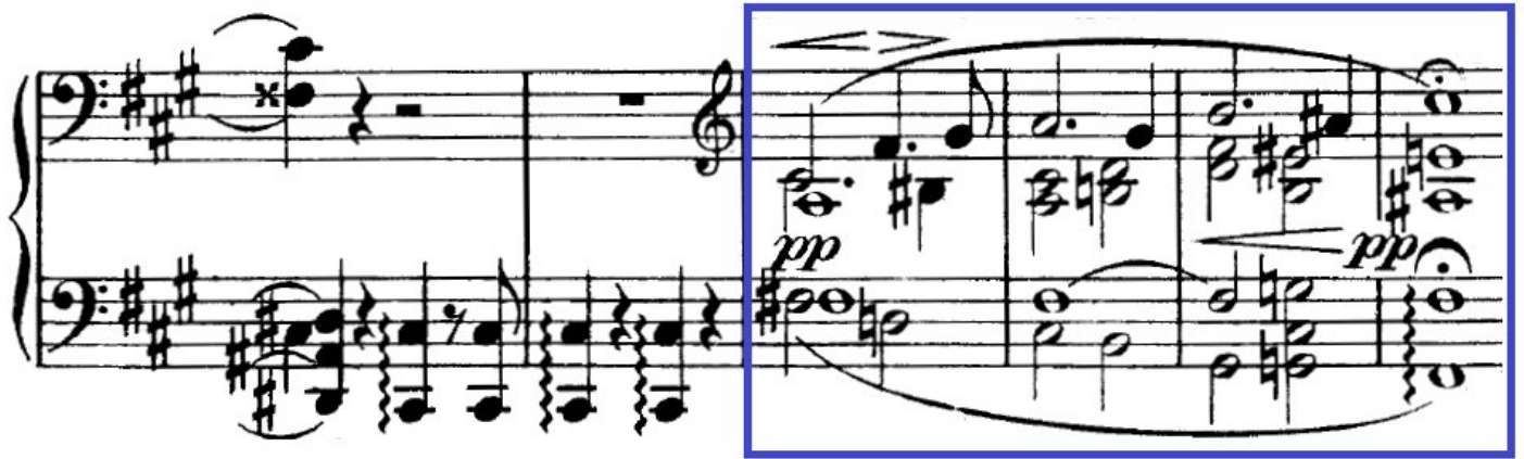
'ANNUNCIATION OF DEATH' LEITMOTIF

The last bars of this 'Annunciation of Death' contains the 'Fate' motive with a slight variation of harmony. Notice that we can almost hear the Tristan Chord there (marked in red in the figure below).