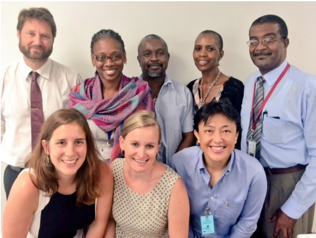
Working on #Cancer when... It was a "Western Countries health problem" @dcp3