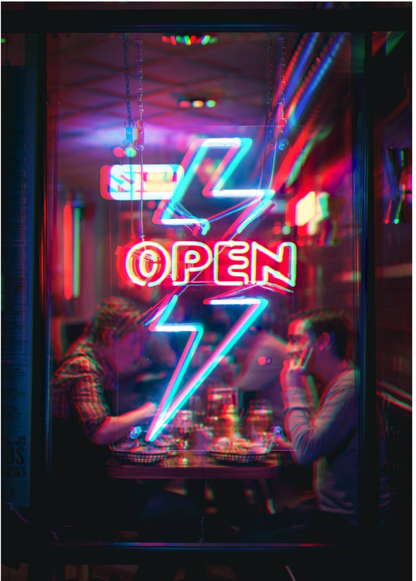
Most DeFi loans take place across days, weeks, or even months.