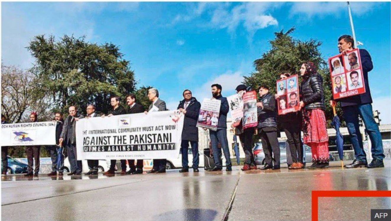
Protesters demonstrate against Pakistan outside the UNHRC in Geneva last year

rights to ultimately serve geopolitical interests and gave a platform to far-right politicians when convergent objectives could be reached."