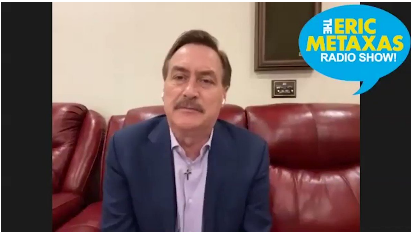
Metaxas segues from promoting MyPillow, to saying that Lindell is getting nothing out of his actions.