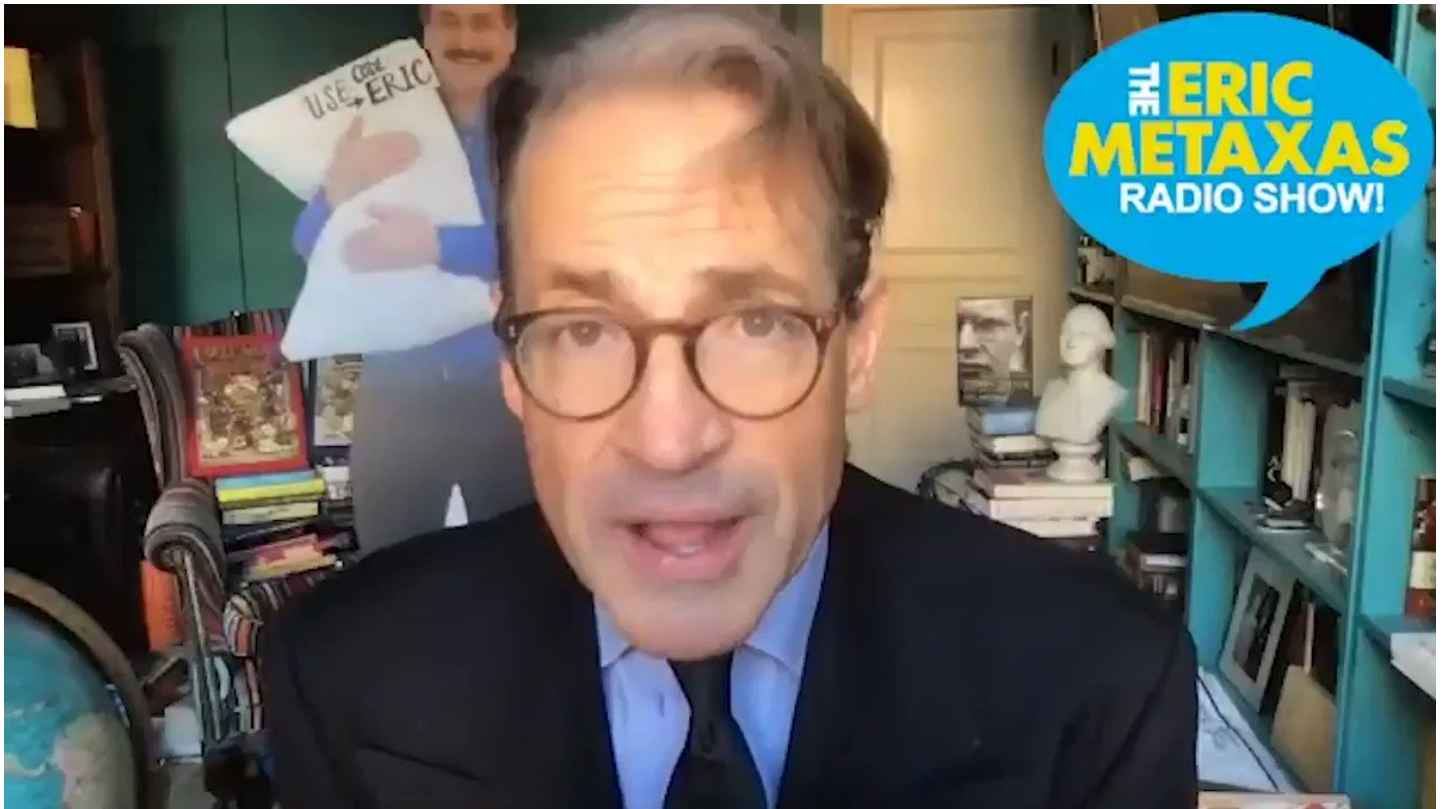
Metaxas repeats Lindell’s baseless allegations about voter totals, and Lindell segues into defending Trump’s call to Georgia’s secretary of state and then claims Trump won GA, AZ, and NV