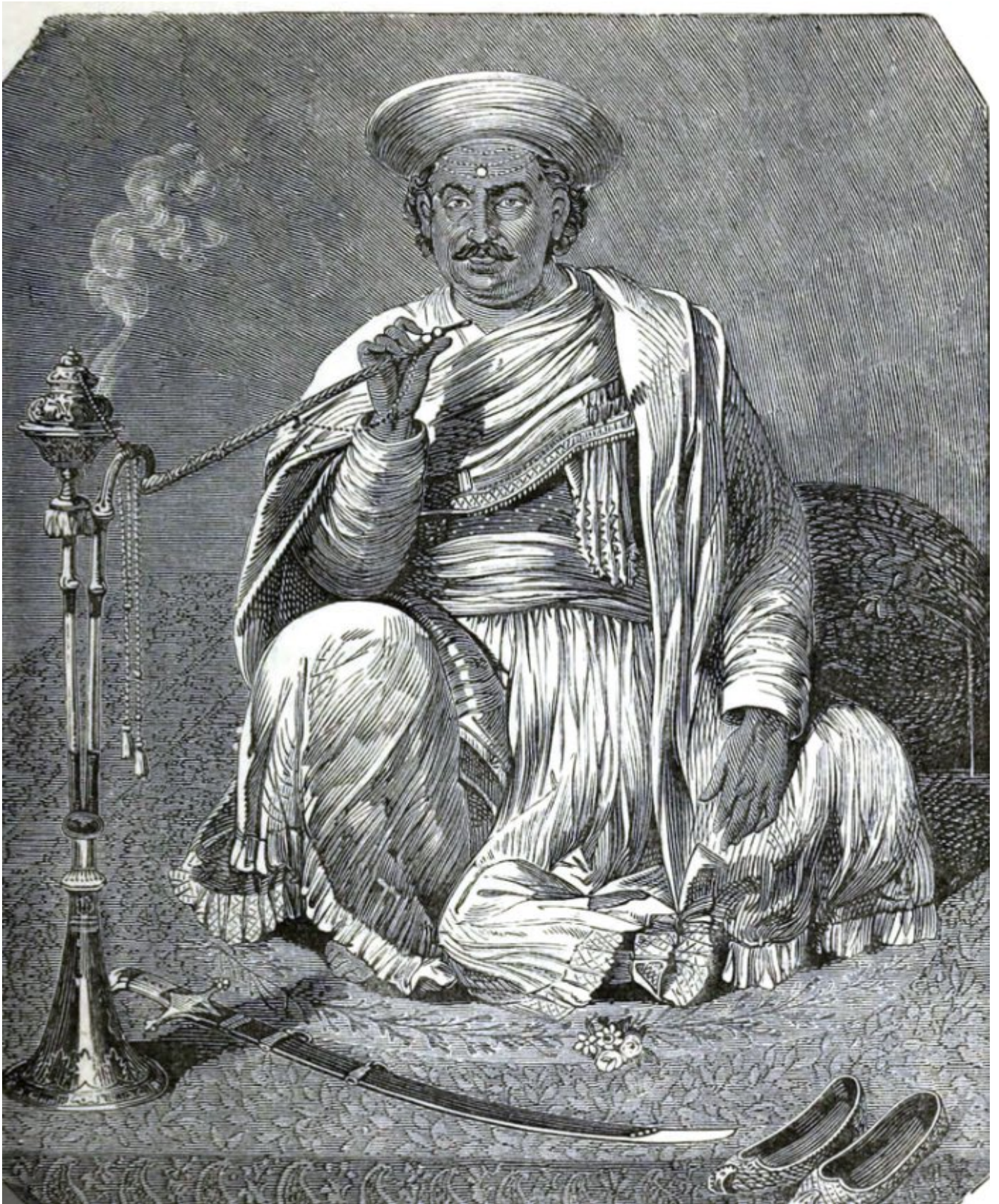
(14/14) Lakshmbai/Manikarnika - She was actually in the artificially created village of Bithur where Bajirao 2 was exiled as her father worked for him. Her childhood friends were Tantia Tope & Nana Saheb. Destiny made her Queen of Jhansi & she died fighting British EIC in 1857