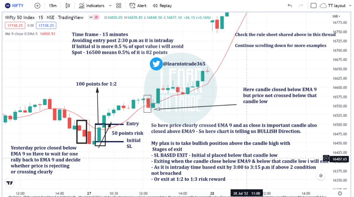
Chart example no - 1

5] If missed anything here check the charts in this thread