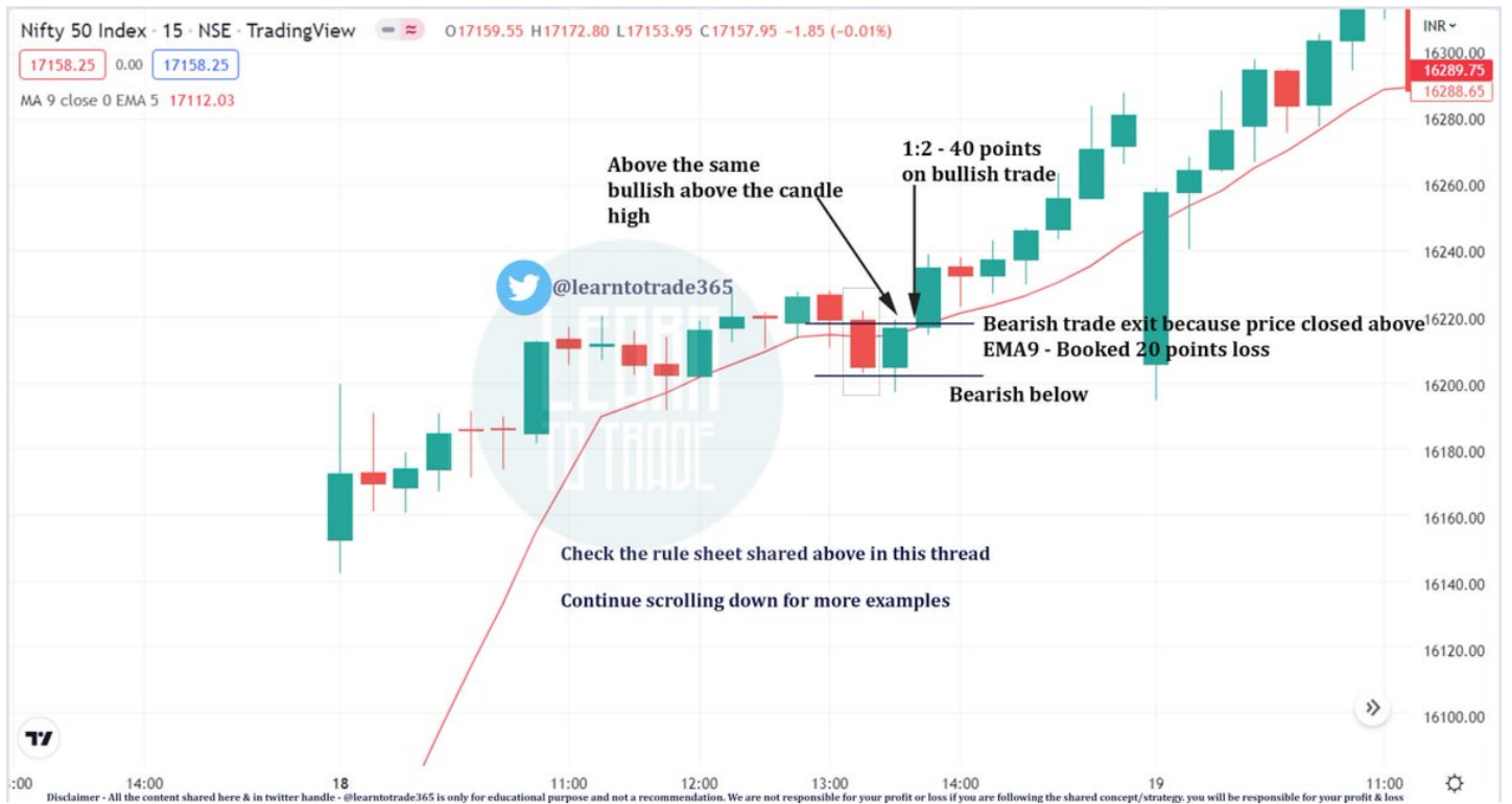
Chart example no -9