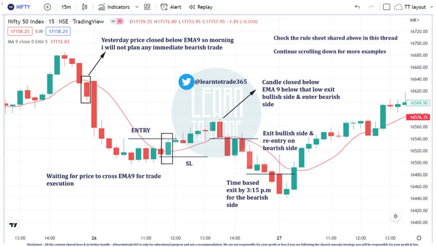
Chart example no - 3