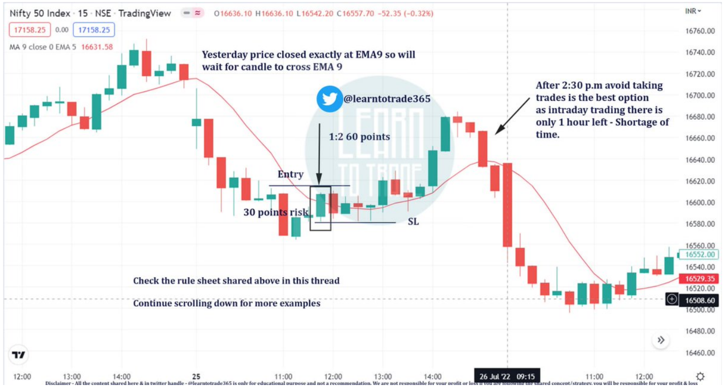
Chart example no - 5