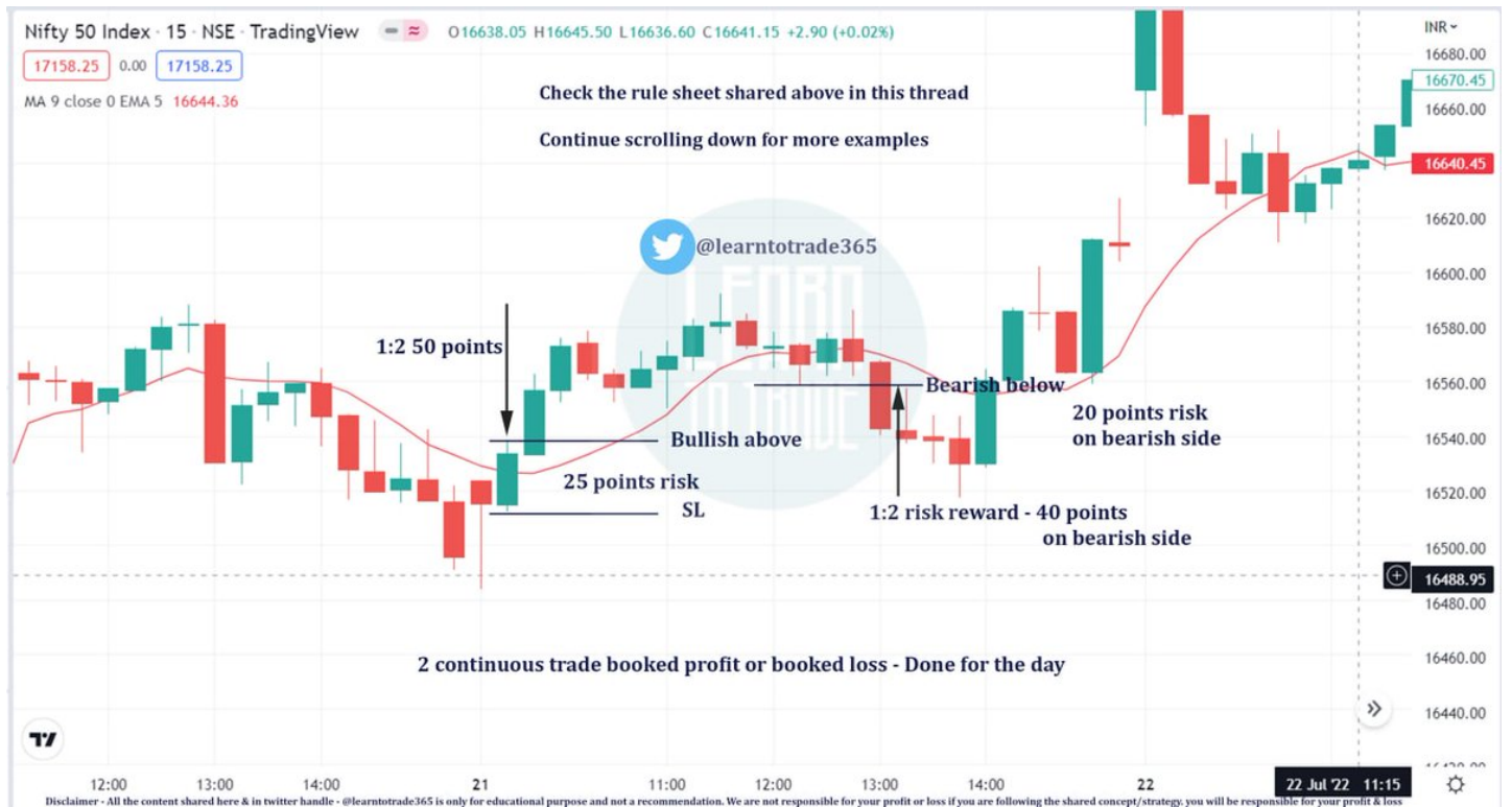
Chart example no -7