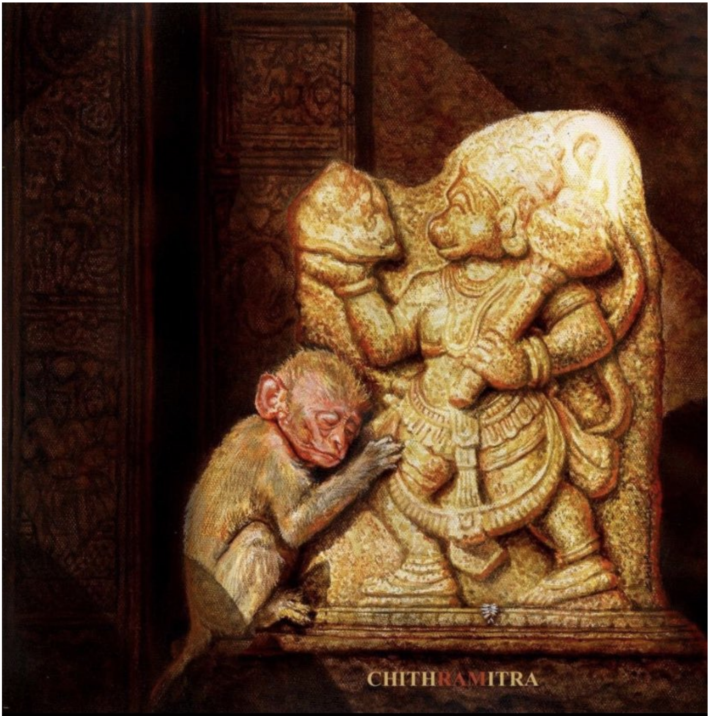
Nandi Ji watches over the kids!