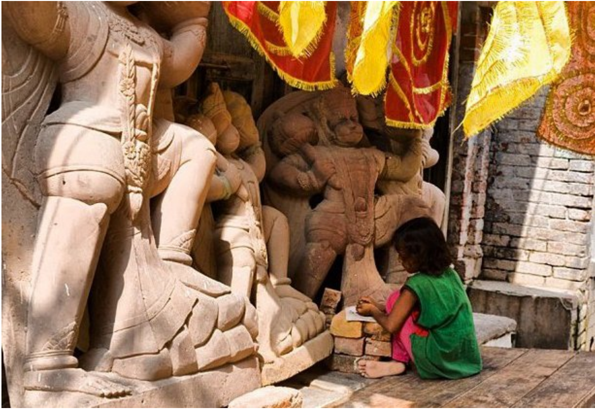
When Nandi Ji decided to assume his watch in front of Mahadev!