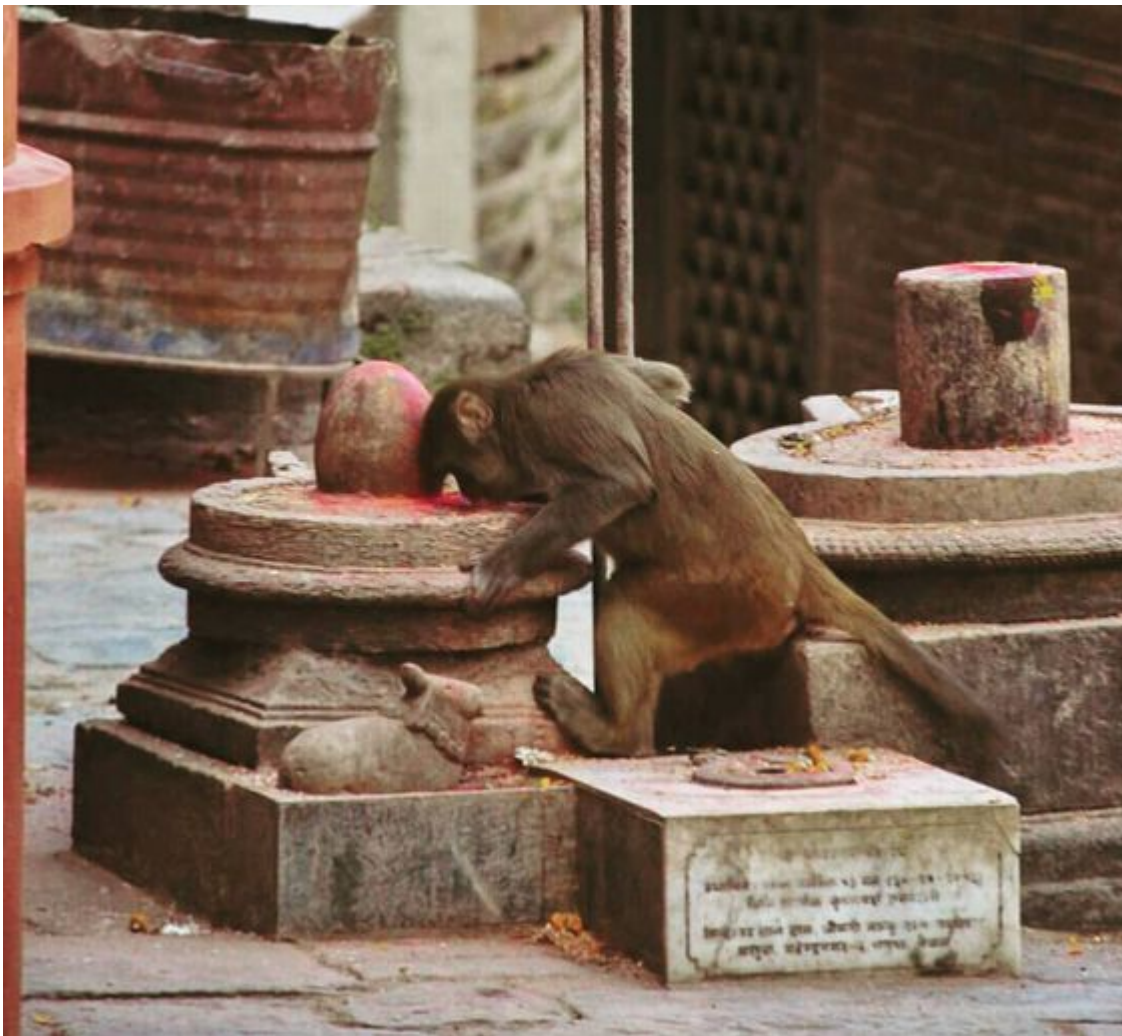
Somewhere in Assam - The King comes to survey his lands!!