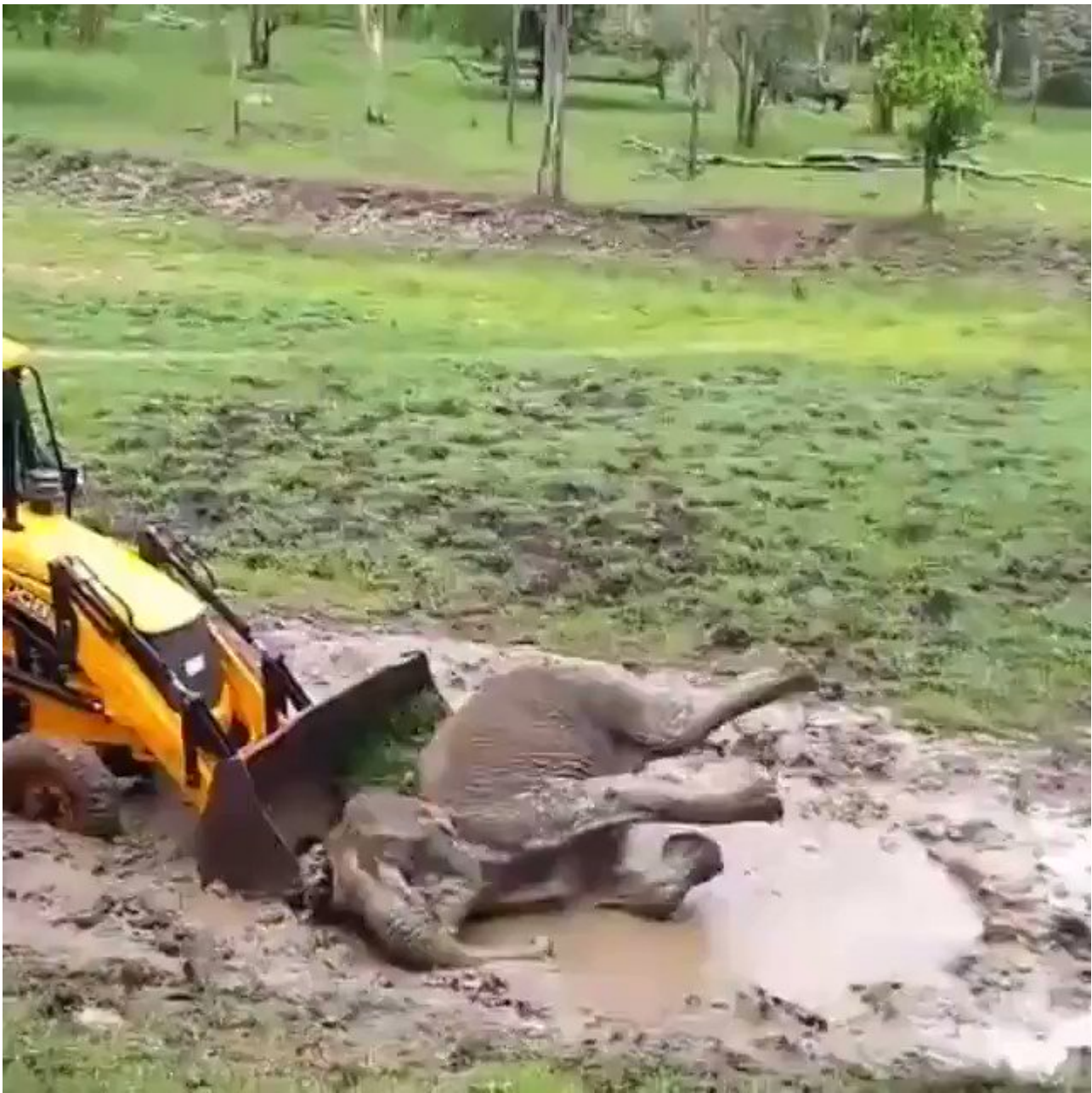
Nap Time .. Sheer Bliss!