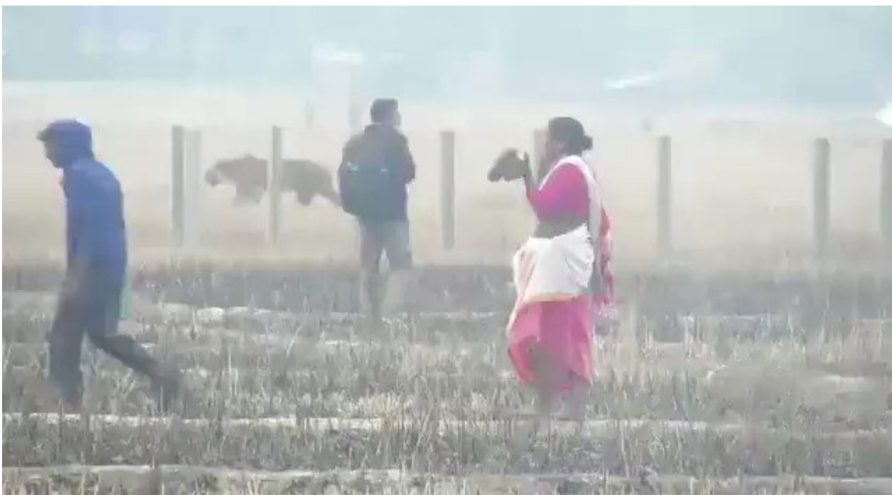
Mutual co-existence benefits all!