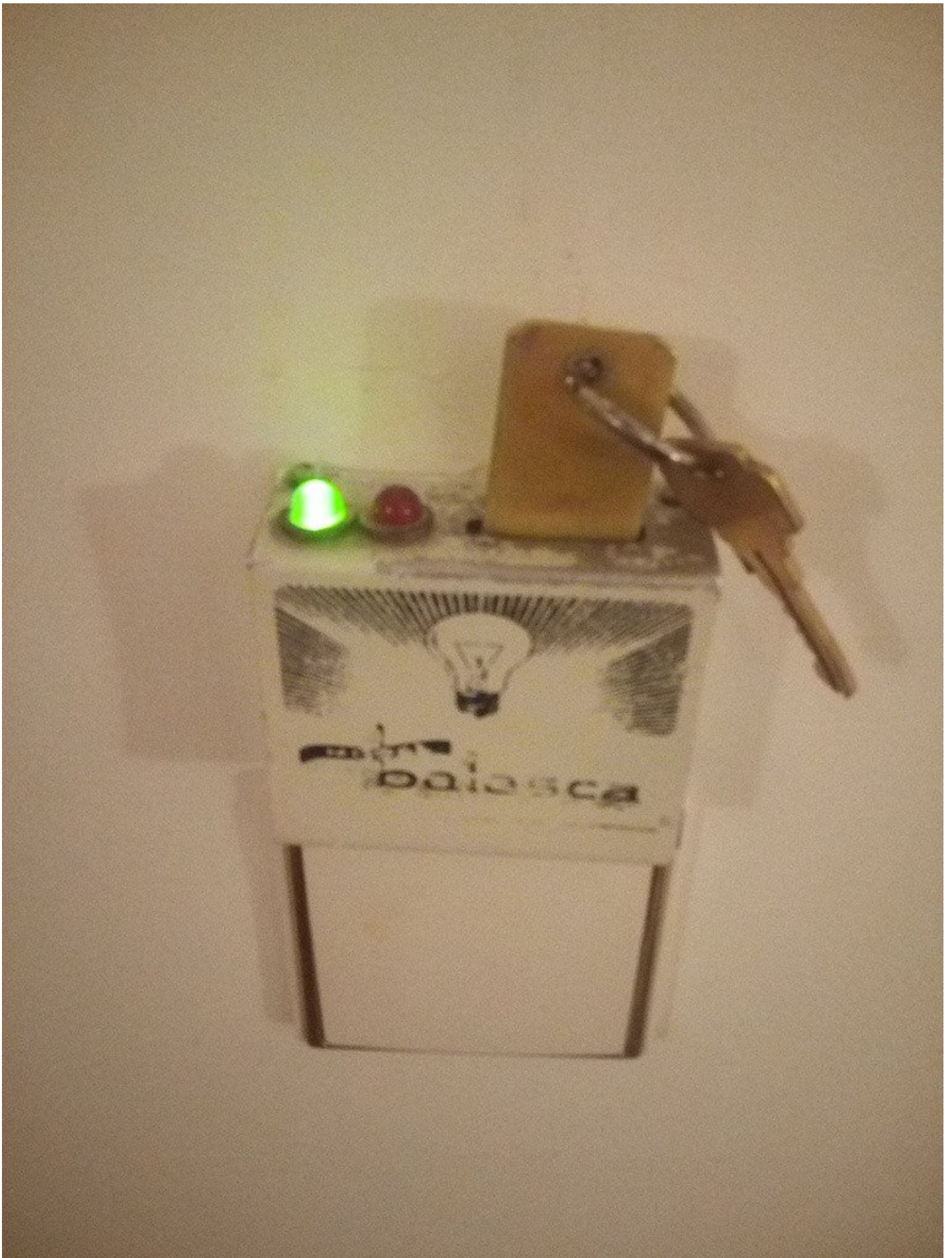
2. The Hotel Balasca, just a few minutes walk across the park from Larissa Station, then hop on the train back to Volos with dear Carla