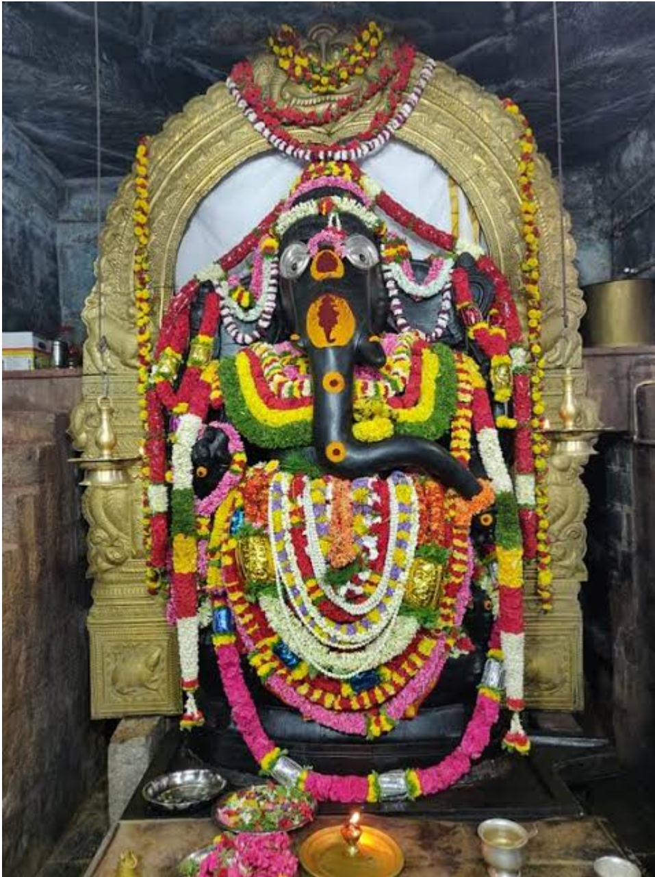
Kurudumale Ganesha Temple is located at Kurudumale, Kolar district. Vigraham of about 13 ft is made of Salagrama sila & prathista is said to be done by Tri Murthy's Brahma, Vishnu & Mahadev. The Tri Murthy's along with Devas when came together are called Koodu male or Kootadri