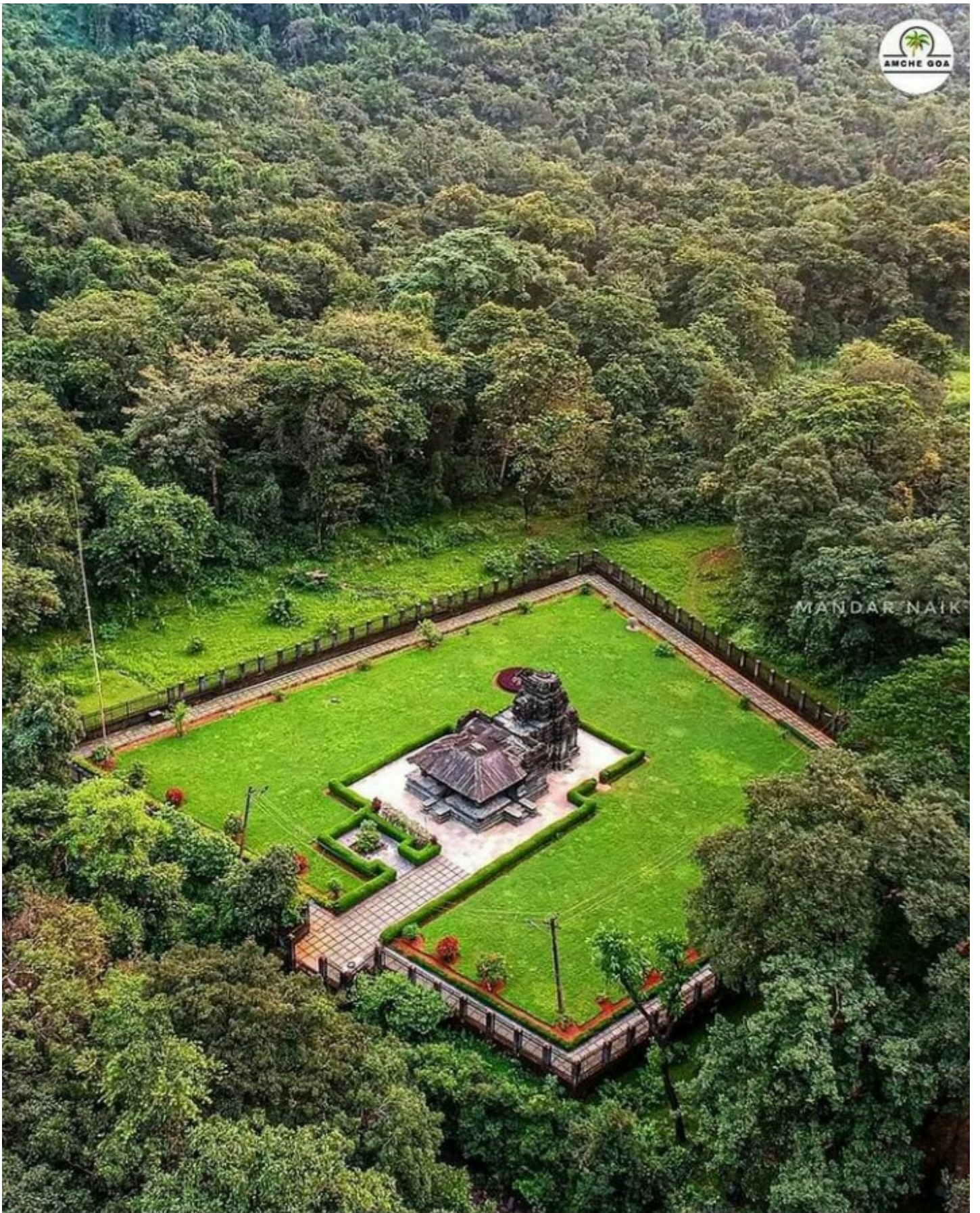
Shri Saptakoteshwar Mahadev mandir is one of the oldest 12th Century mandir in goa located at Narve town, Mahadev is worshipped here as Saptakoteshwar who is considered as the deity of the Kings of the Kadamba dynasty of Goa