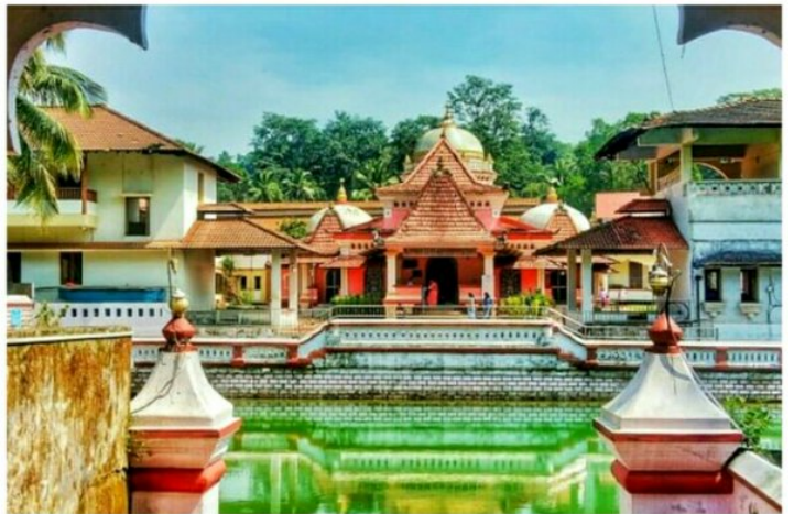
Lying on a hillock in a village named Mangeshi one of the most popular, richest and largest Hindu temples in Goa is Mangeshi Mahadev temple built in the Goan hindu style of architecture is More than 450 years old