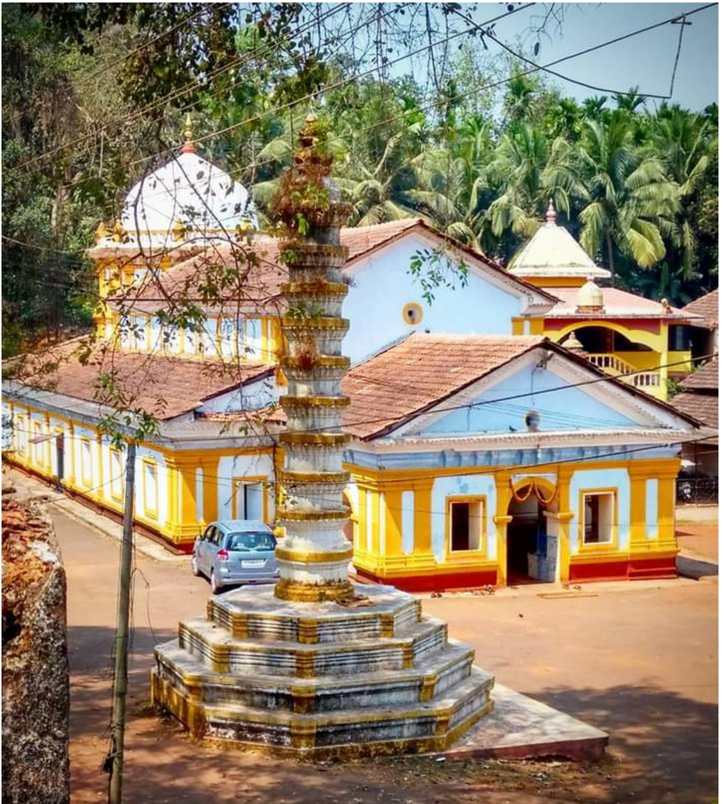
Shri Nageshi mandir is considered to be Swayambhu shrine of Mahadev popularly known for its miraculous powers built during 1413 CE located in Ponda Goa and it's one of the unaffected mandir of Goa from Portuguese invansion