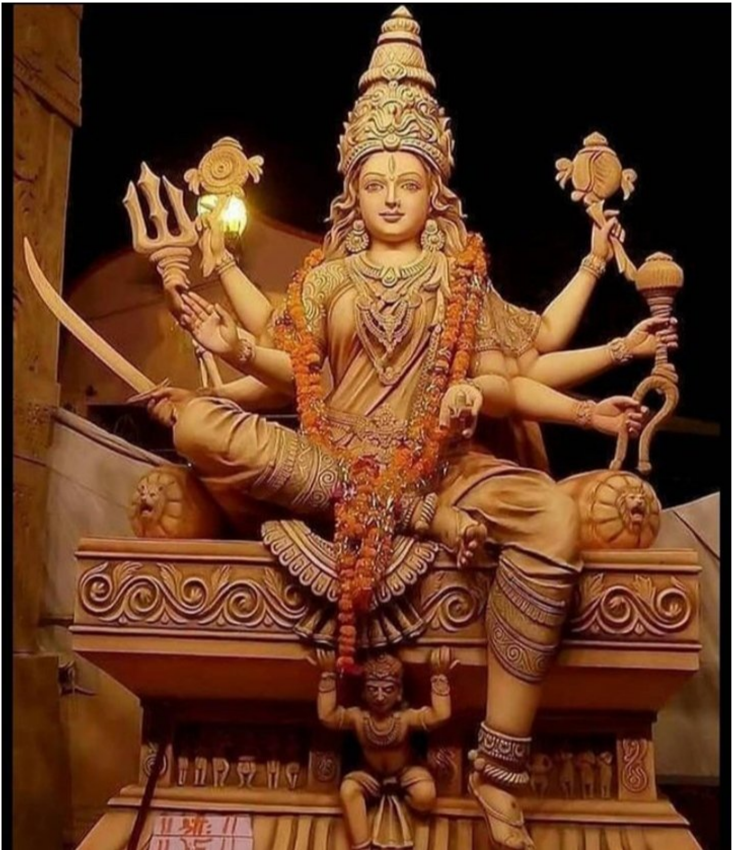
Goddess Lalita Tripura Sundari, the goddess of power, is considered as her Saguna Svarupa (Manifested form) i.e. Lalita Tripura Sundari is the truest material form of the Goddess, possessing the three qualities (satva, rajas and tamas).