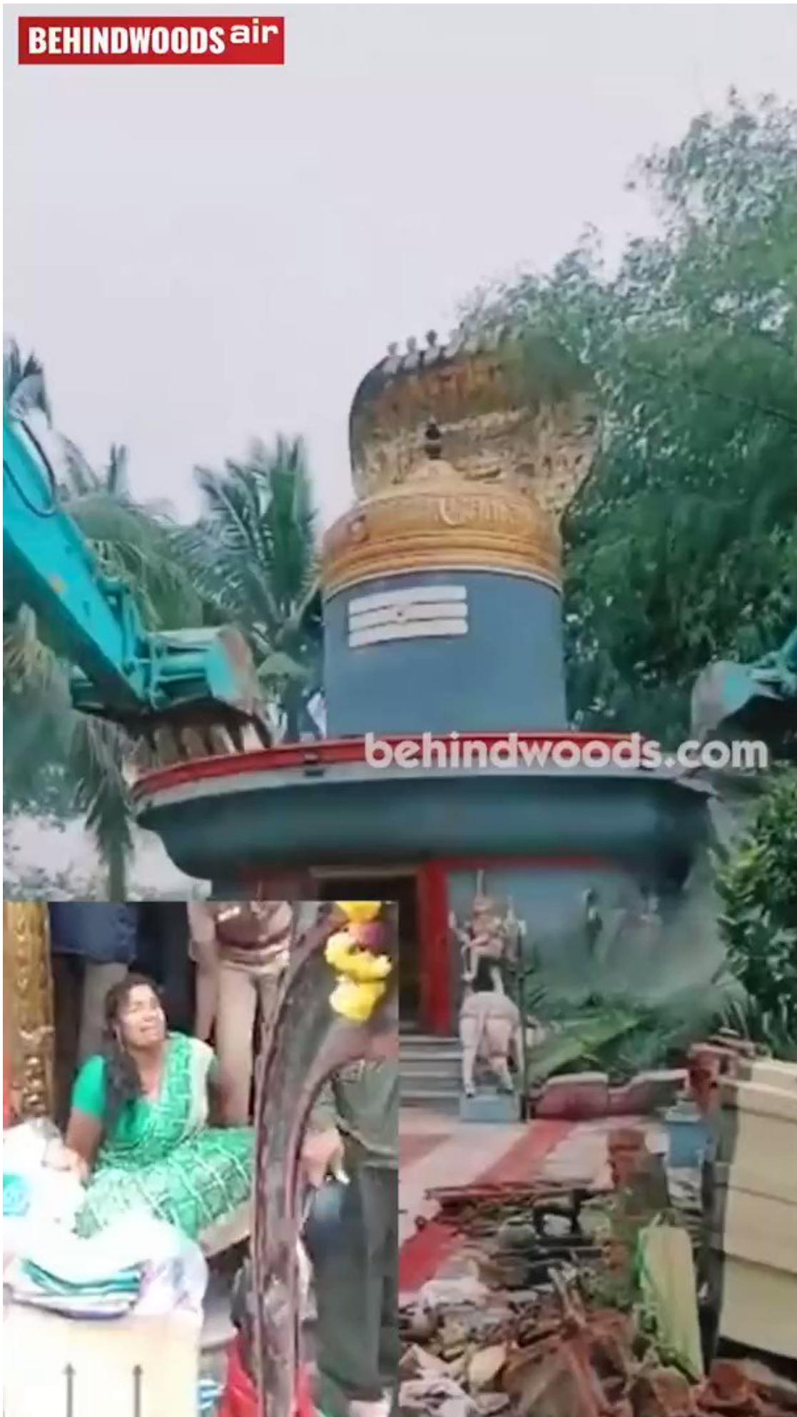
■ Kanaka K ■ ■ ■ ■ varar is one of the 108 important Siva temples located around Kanchi K ■ ■ ■ ■ ■