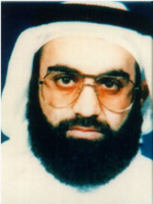
Khalid Sheikh Mohammed in 2001