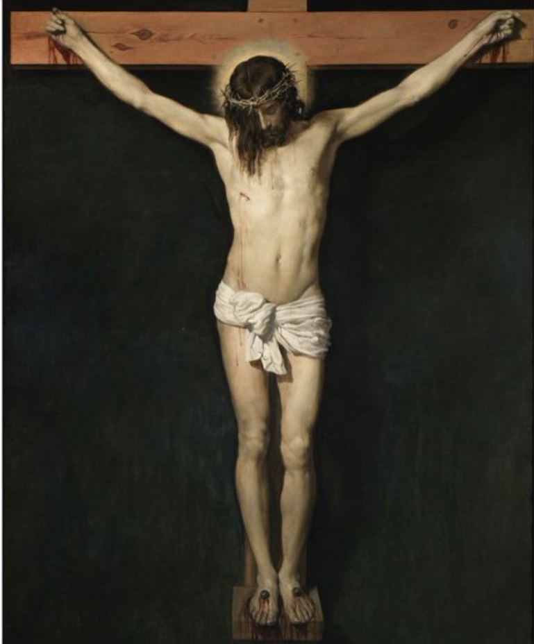
2/4 Early #Christianity converts were slaves with lot to gain from Roman Empire collapse who didn't follow Roman rituals secretly