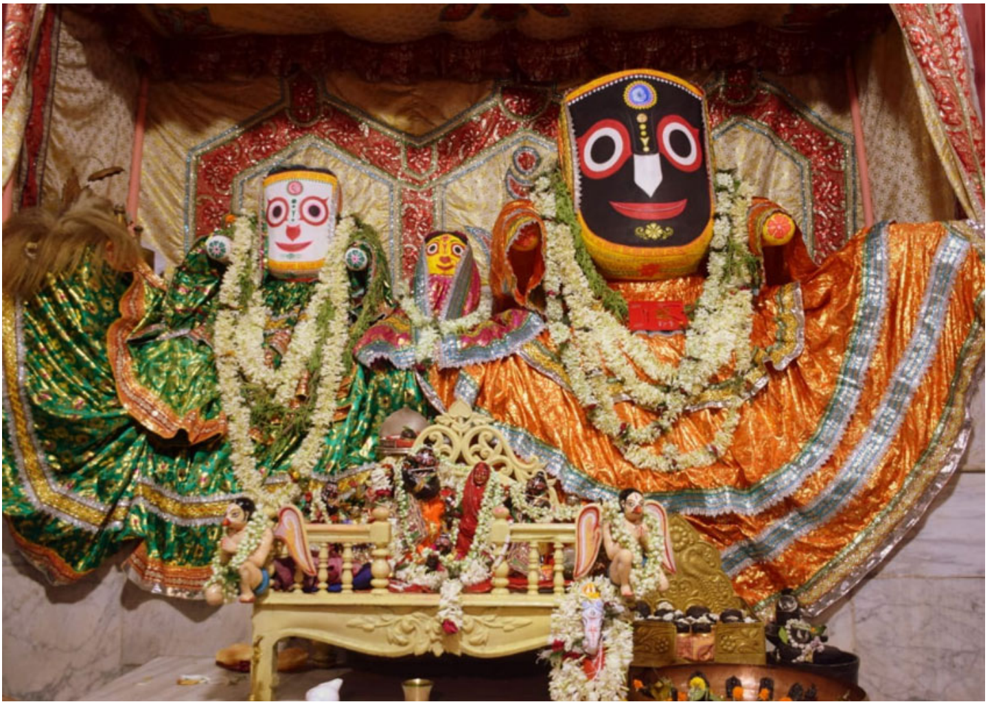
We call it Maheshwari Rath Yatra This is the 2nd most oldest Rath Yatra after Puri & the oldest in Bengal. Lakhs of people visit here every year for Darshan thus making it famous.