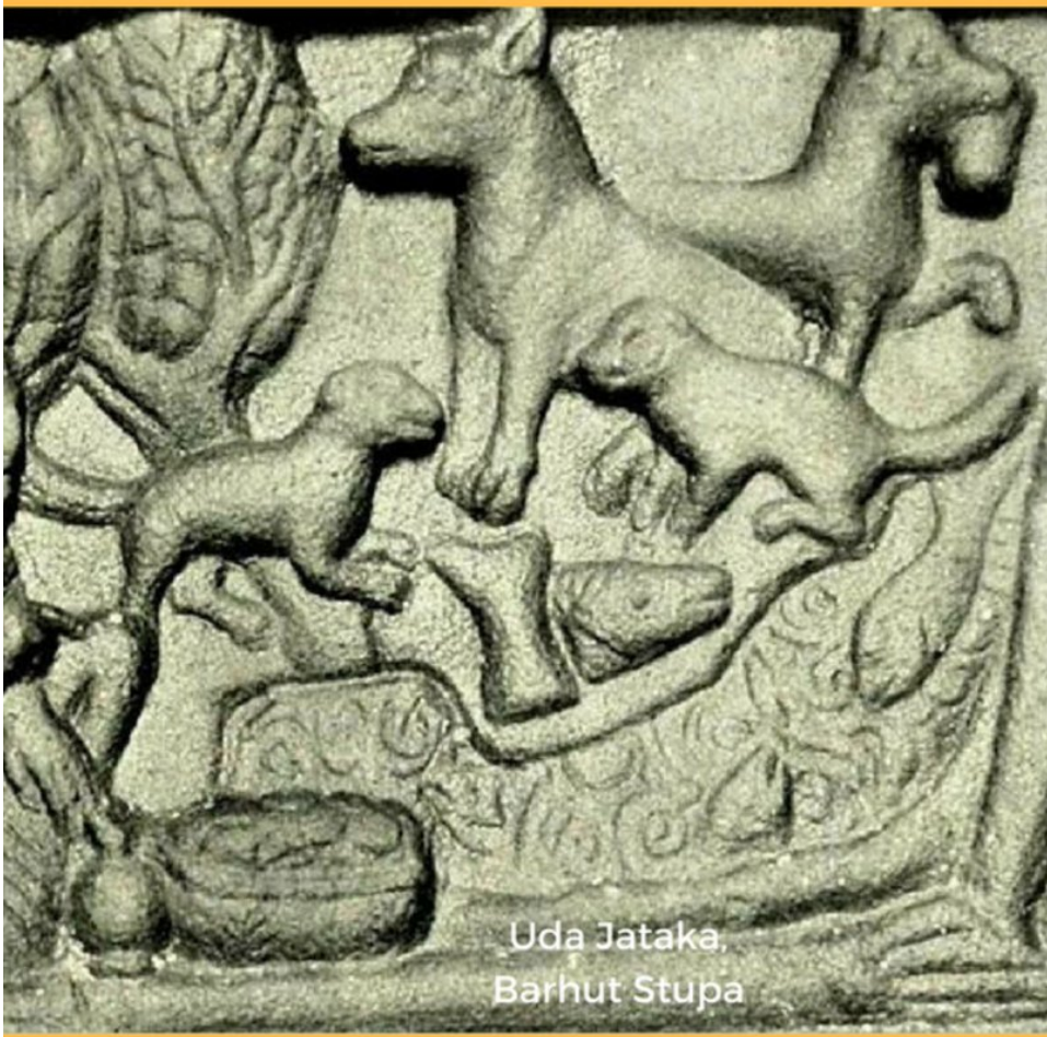
Uda Jataka, Barhut Stupa