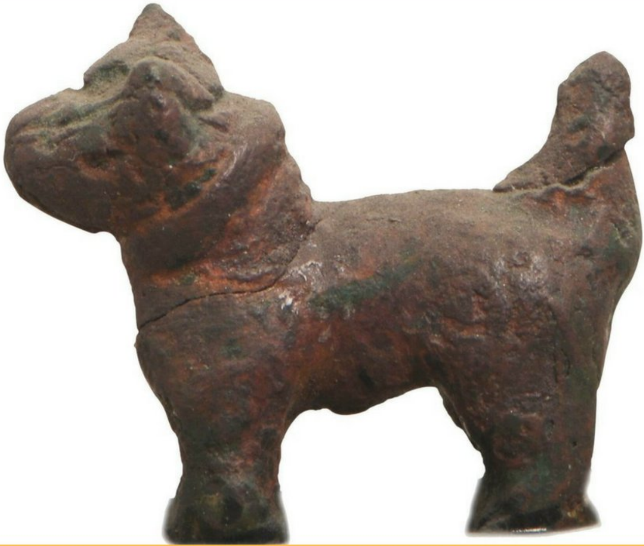
BRONZE DOG, MOHENJODARO | NATIONAL MUSEUM DELHI