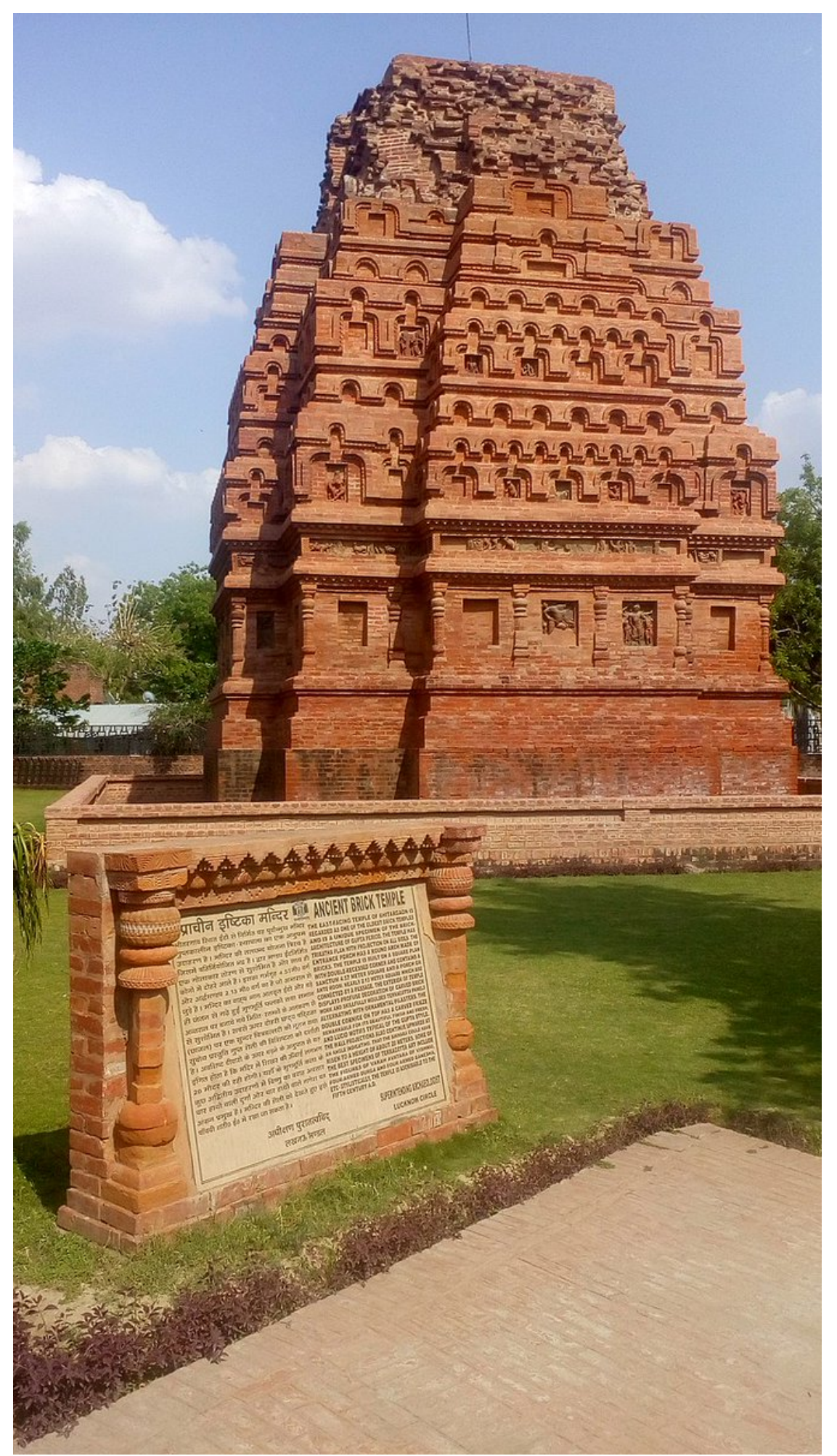
Its upper chamber did sustain some damage in the 18th century.