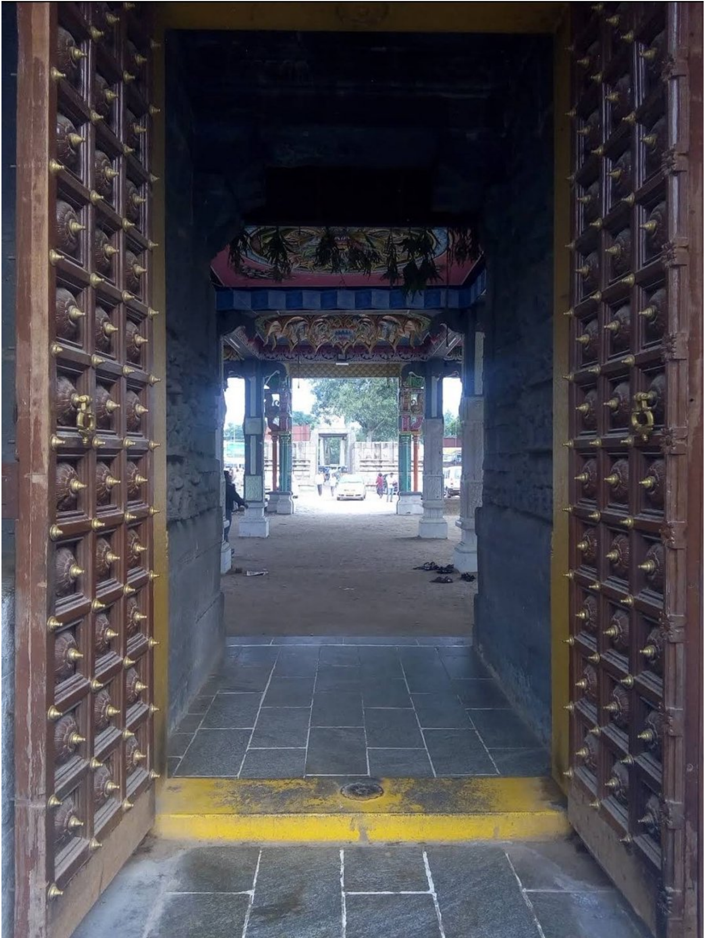
Mahavishnu wore all the lotus flowers as a garland and was resting in a reclining posture, giving Pundareeka darshan as seen in Paarkadal. The temple stands on the shore of Mahabalipuram. Vaikunta Ekadashi is very famous here.