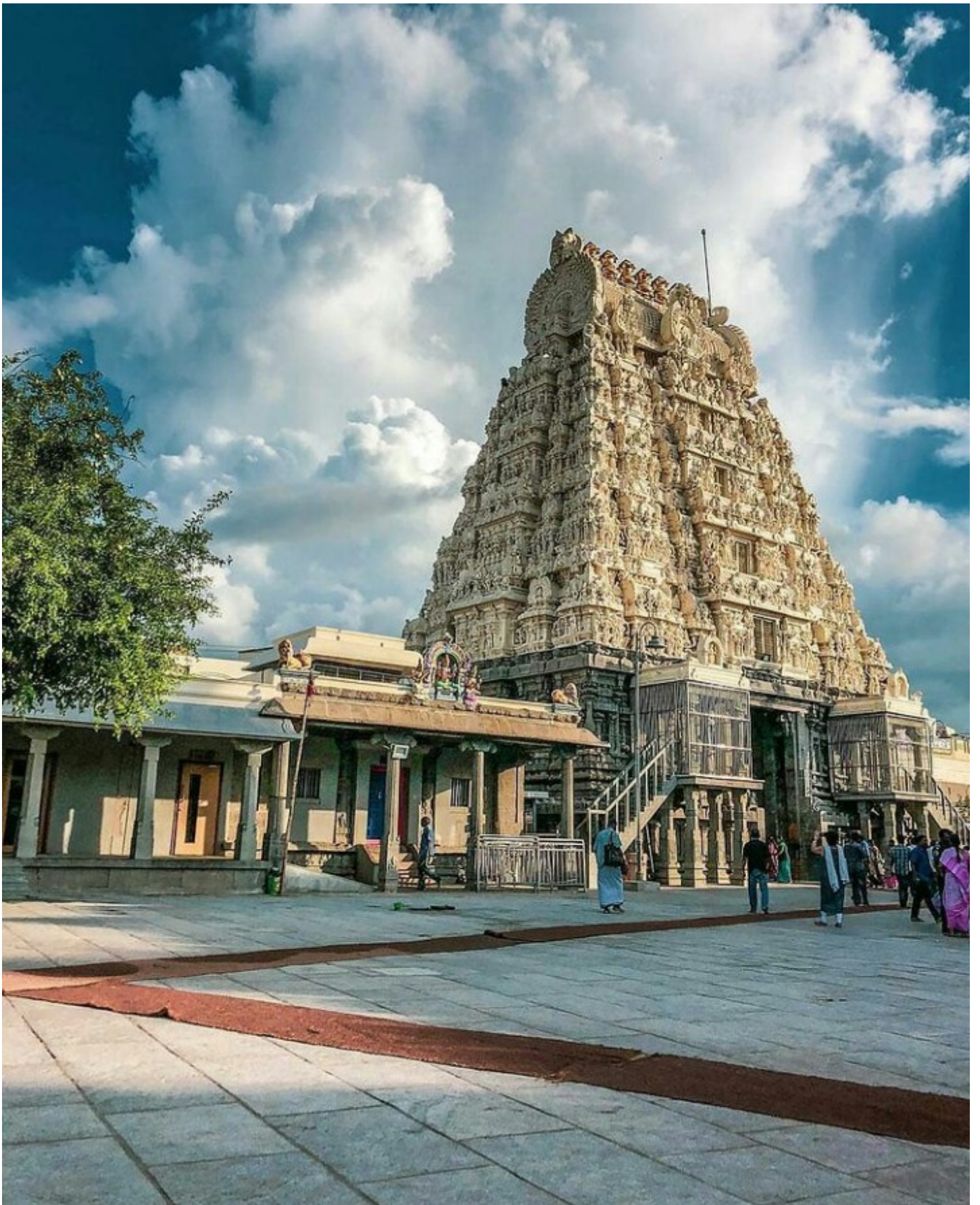
Ayodhya, Ujjain (Avantika), Mathura, Dwaraka. Kanchi Kamakshi Amman is Mukti Sthala of South.

Temple is one among 51 Shakti Peetha. It is believed that Nabhi or Navel of Sati Devi fell here. Sthala puranam says that Kamakshi amman did tapasya here on Panchagni to marry Mahadeva.