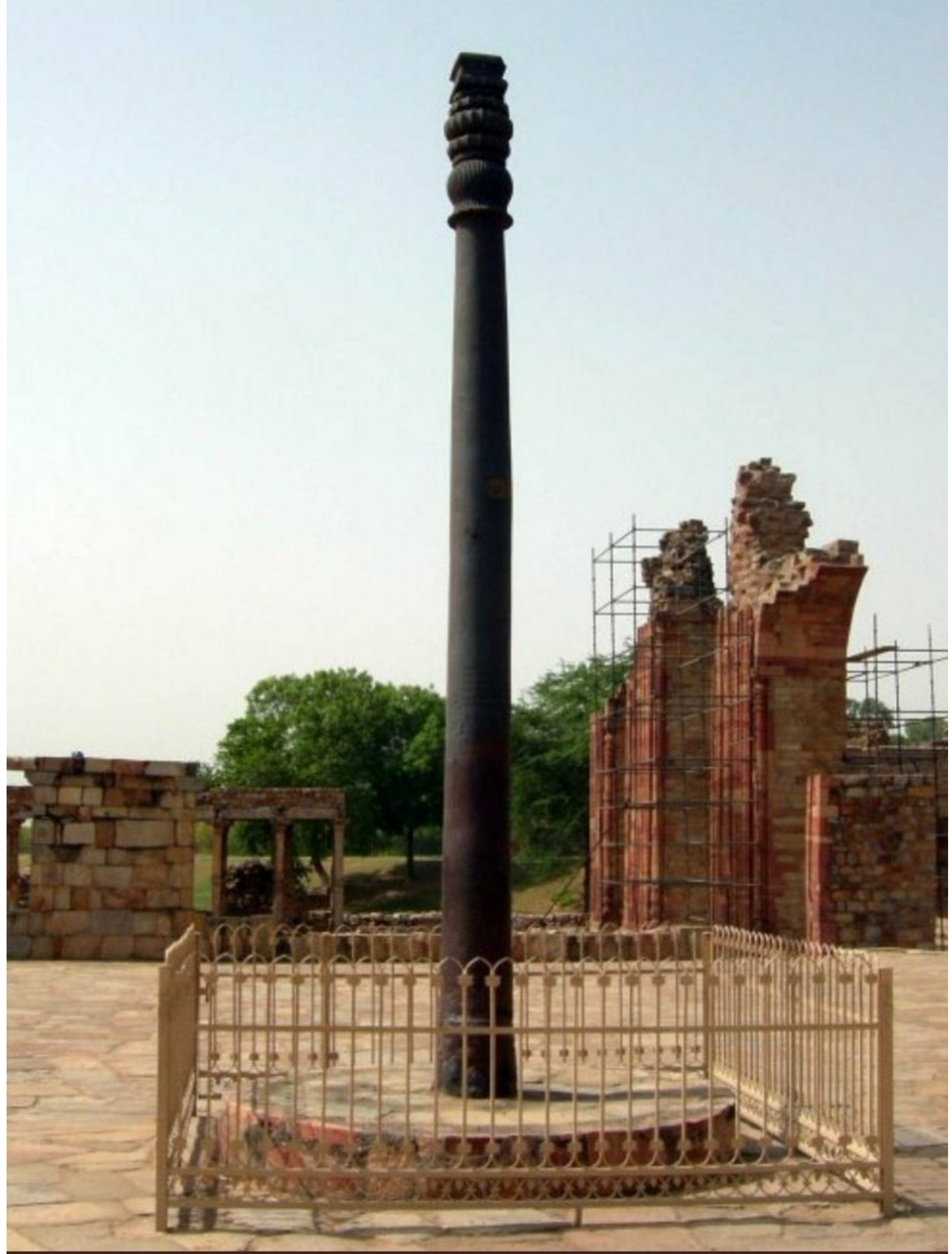
Now look at another pictures clearly depicting ancient Mandir architecture.

You can clearly see "Ashtkon"(eight edged) Piller which has been a part of Ancient Architecture.